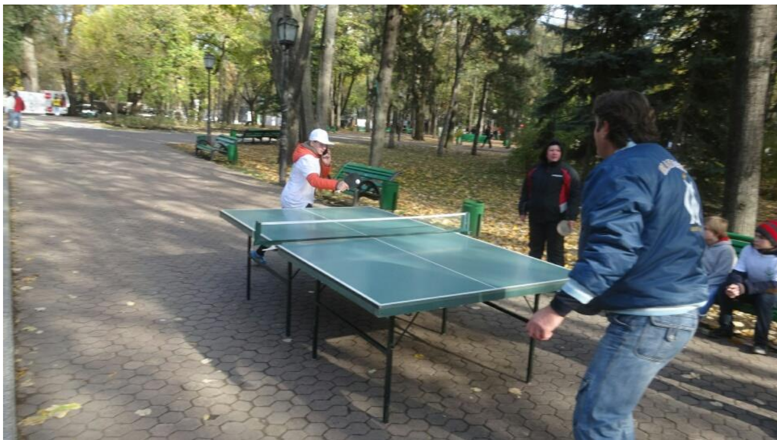
Cell Phone Ping Pong