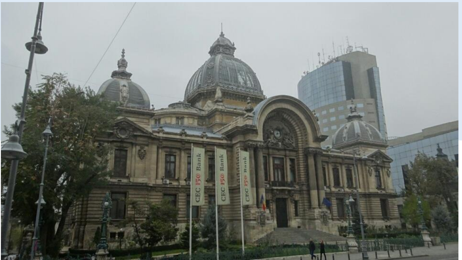
Palace of the savings Bank