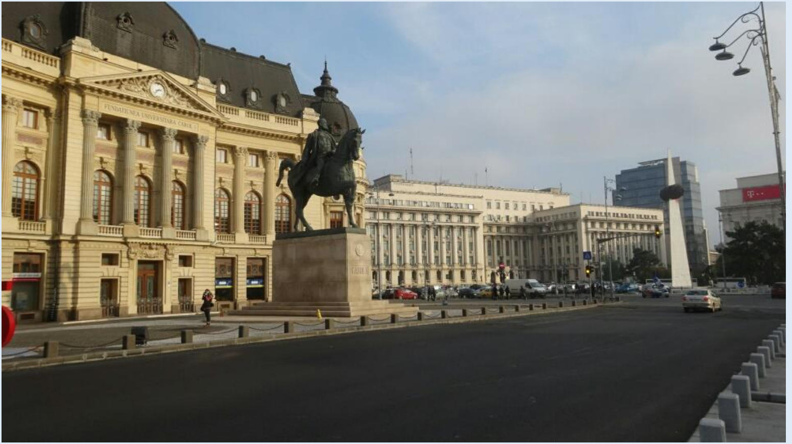
King Charles I

November 2014: The capital and largest city in Romania sometimes called little Paris. On the balcony of the old communist party headquarters in revolution square Nicolae Ceaușescu gave his last speech. The crowd turned on him and he fled. Three days later he and his wife were executed. He left behind an unfinished edifice later completed and renamed Parliament Palace. With 12 stories and over 1,100 rooms it is one of the biggest buildings in the world.