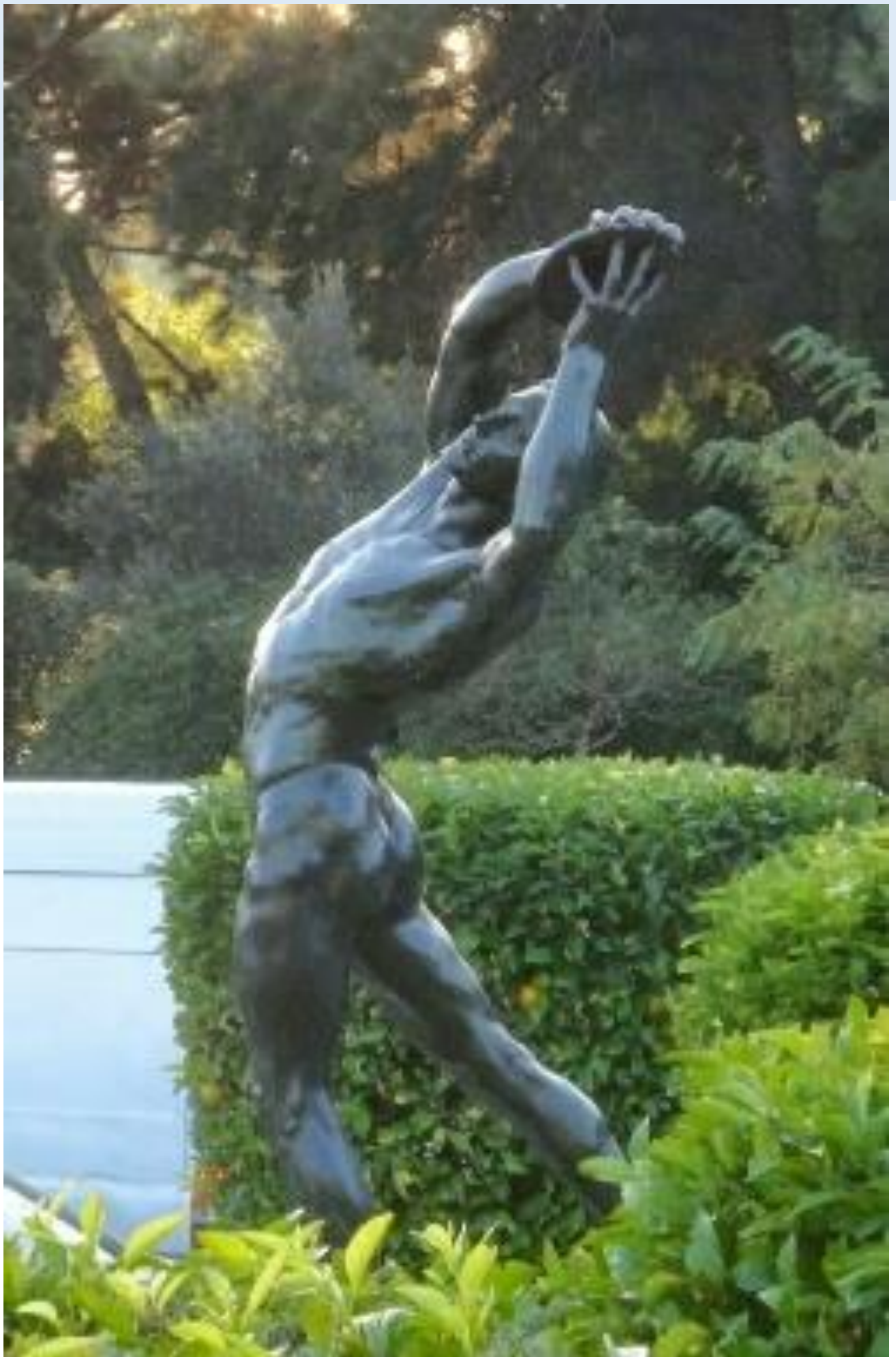
Outside Panathenaic Stadium