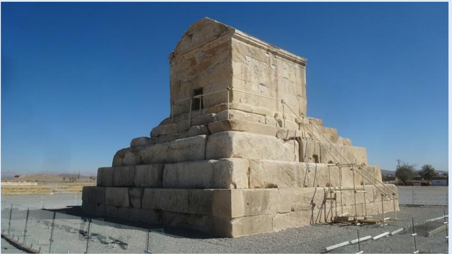
Cyrus the Great Tomb

The Persians call Isfahan "Nesf-e-Jahan" meaning "Half The World". With one of the largest public squares in all the world, stunning architecture and tree-lined boulevards it is truly beautiful.