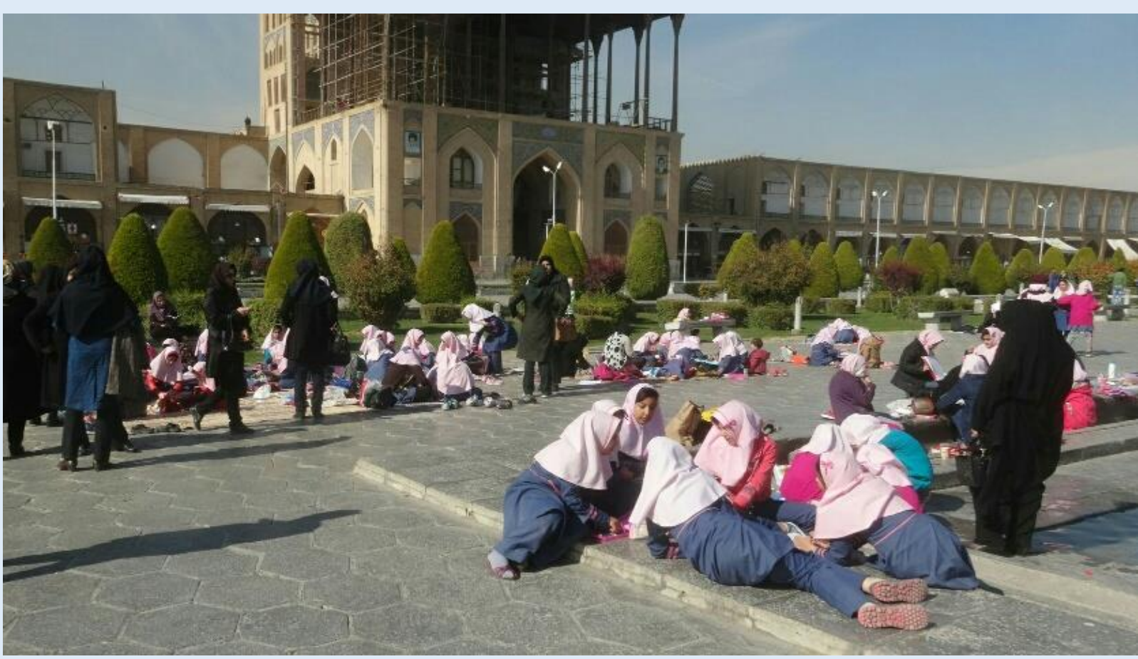
Naqsh-e Jahan Square