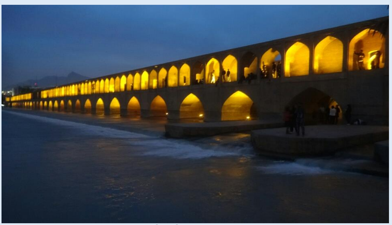
Si-o-She Pol Bridge