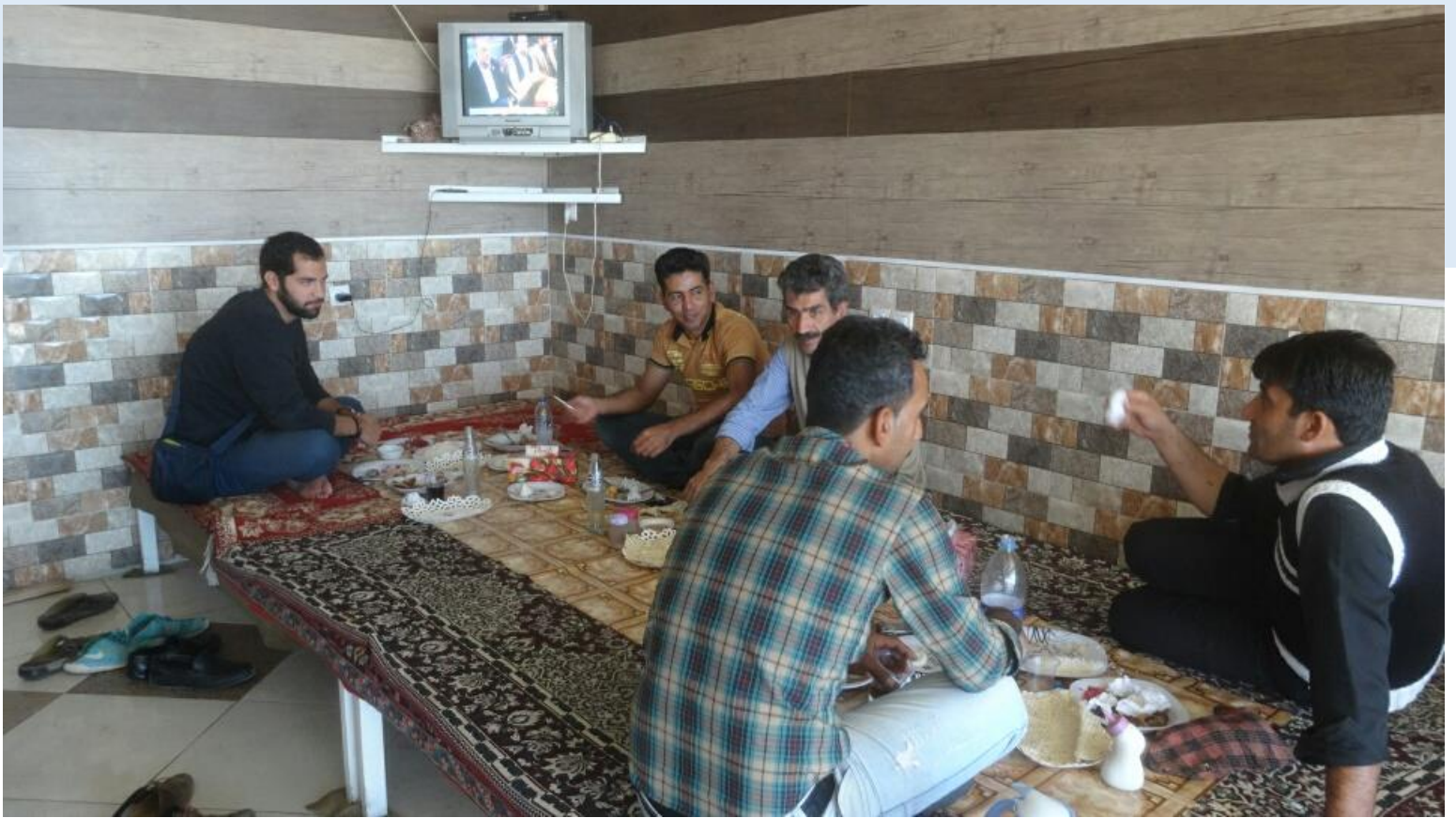
Truck Stop Lunch