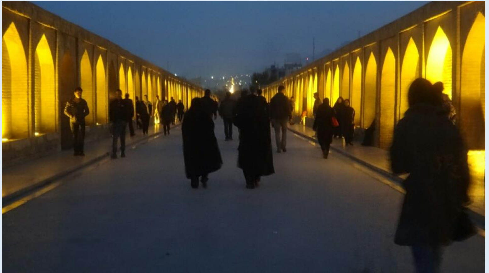
Si-o-She Pol Bridge