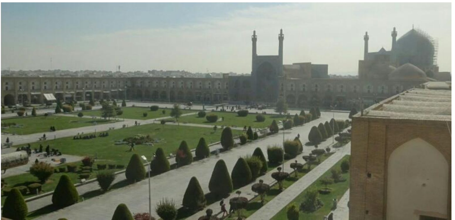
Naqsh-e Jahan Square