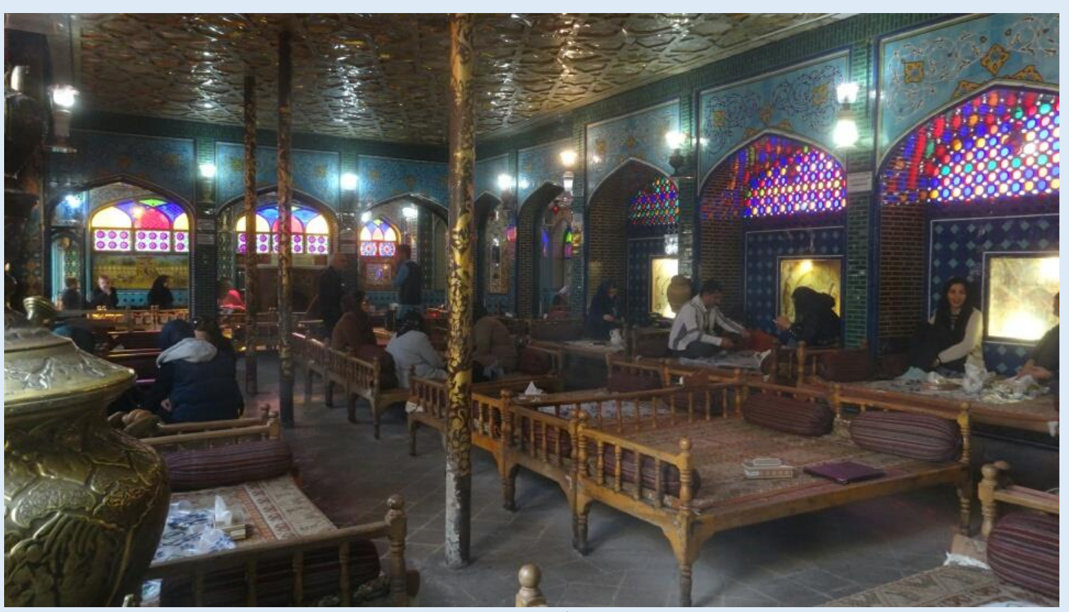
Lunch in Isfahan