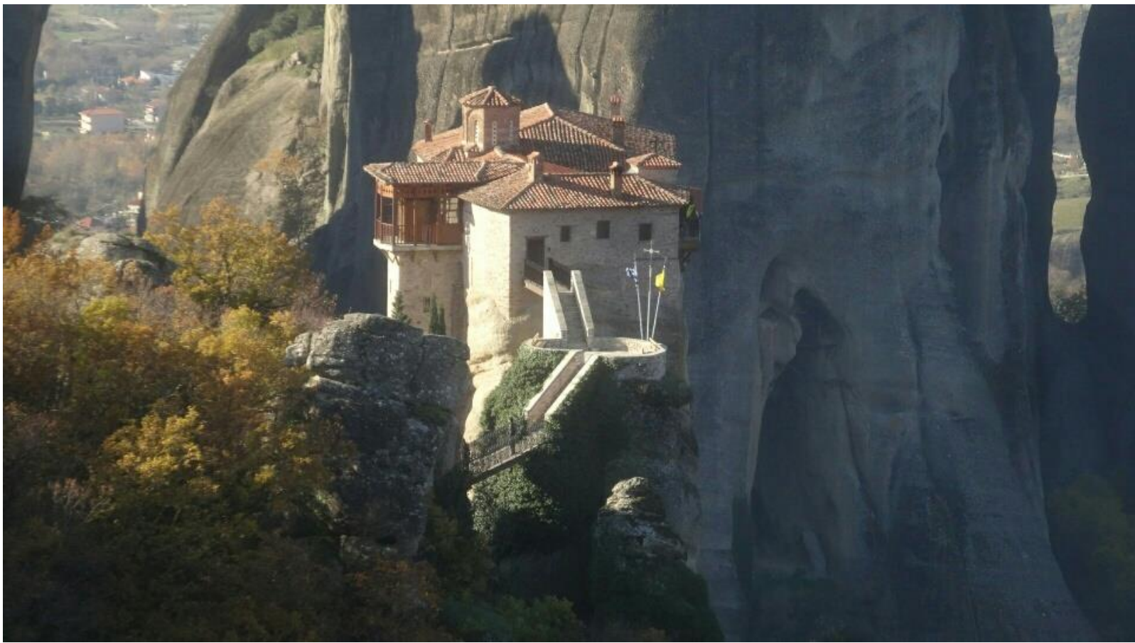
Monastery of Rousanou