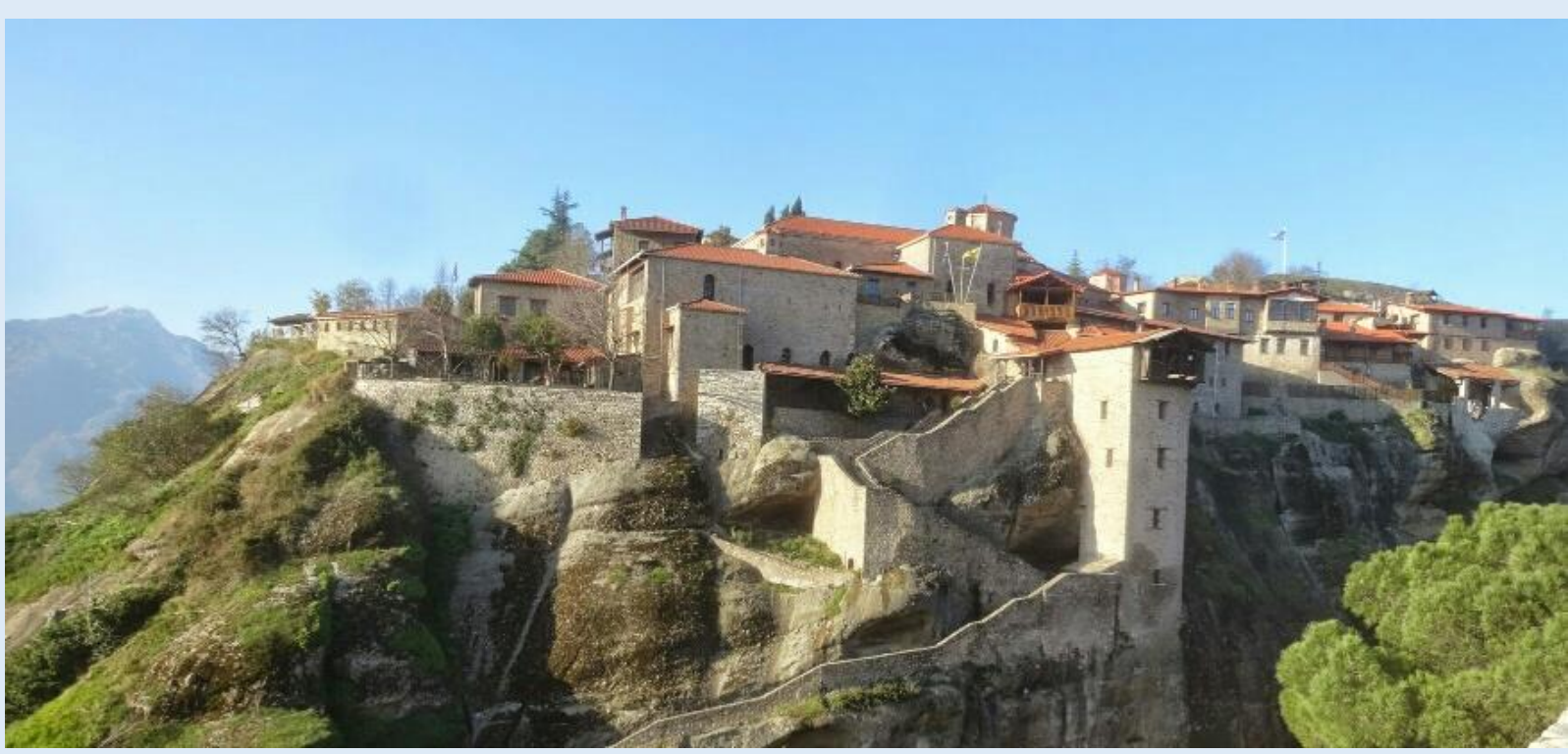
Great Meteor Monastery