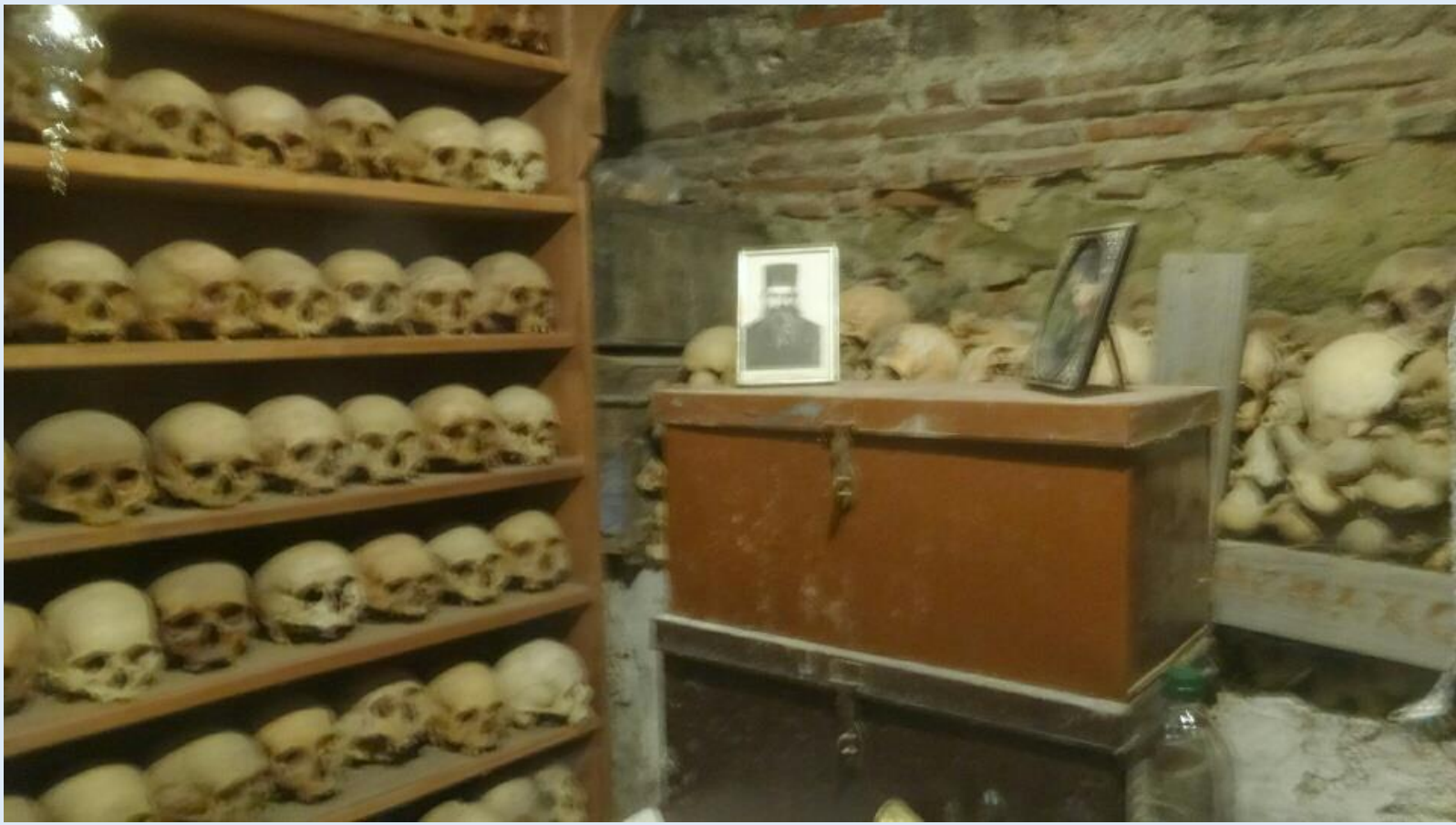
Inside Great Meteor Monastery