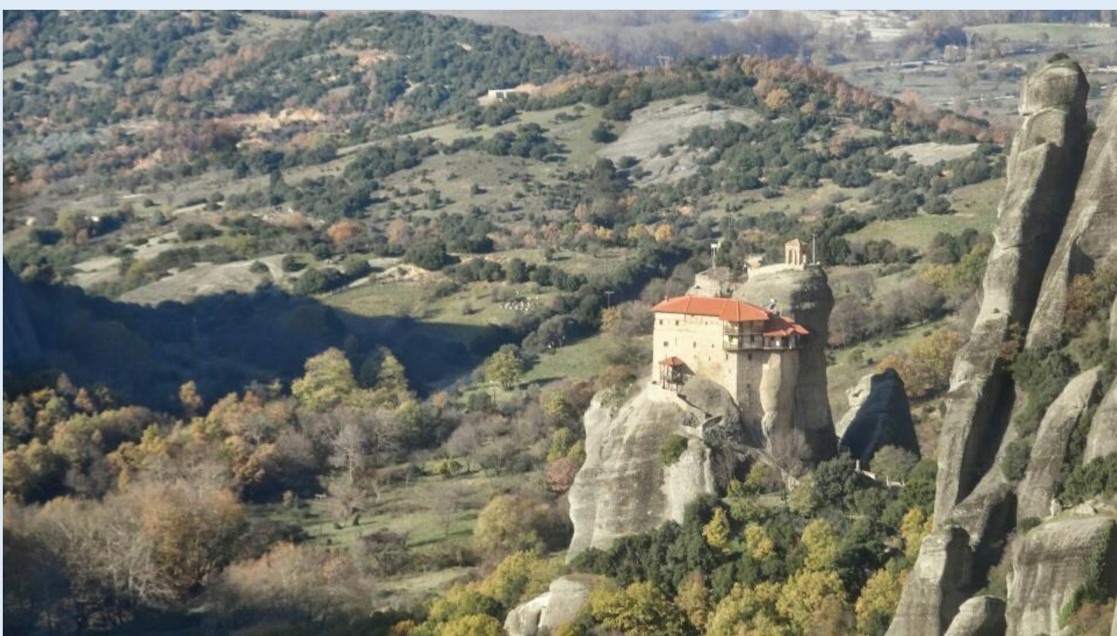
Saint Nicholas Monastery