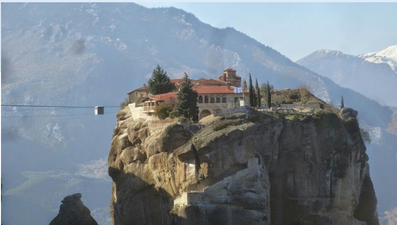
Holy Trinity Monastery