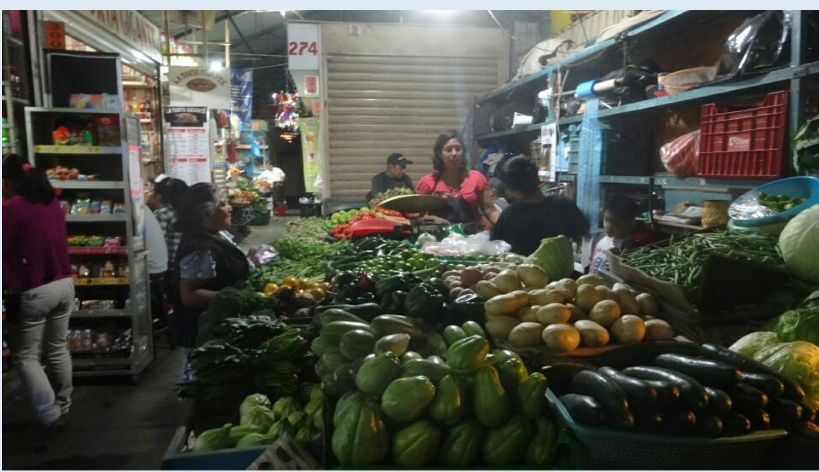
Benito Juarez Market