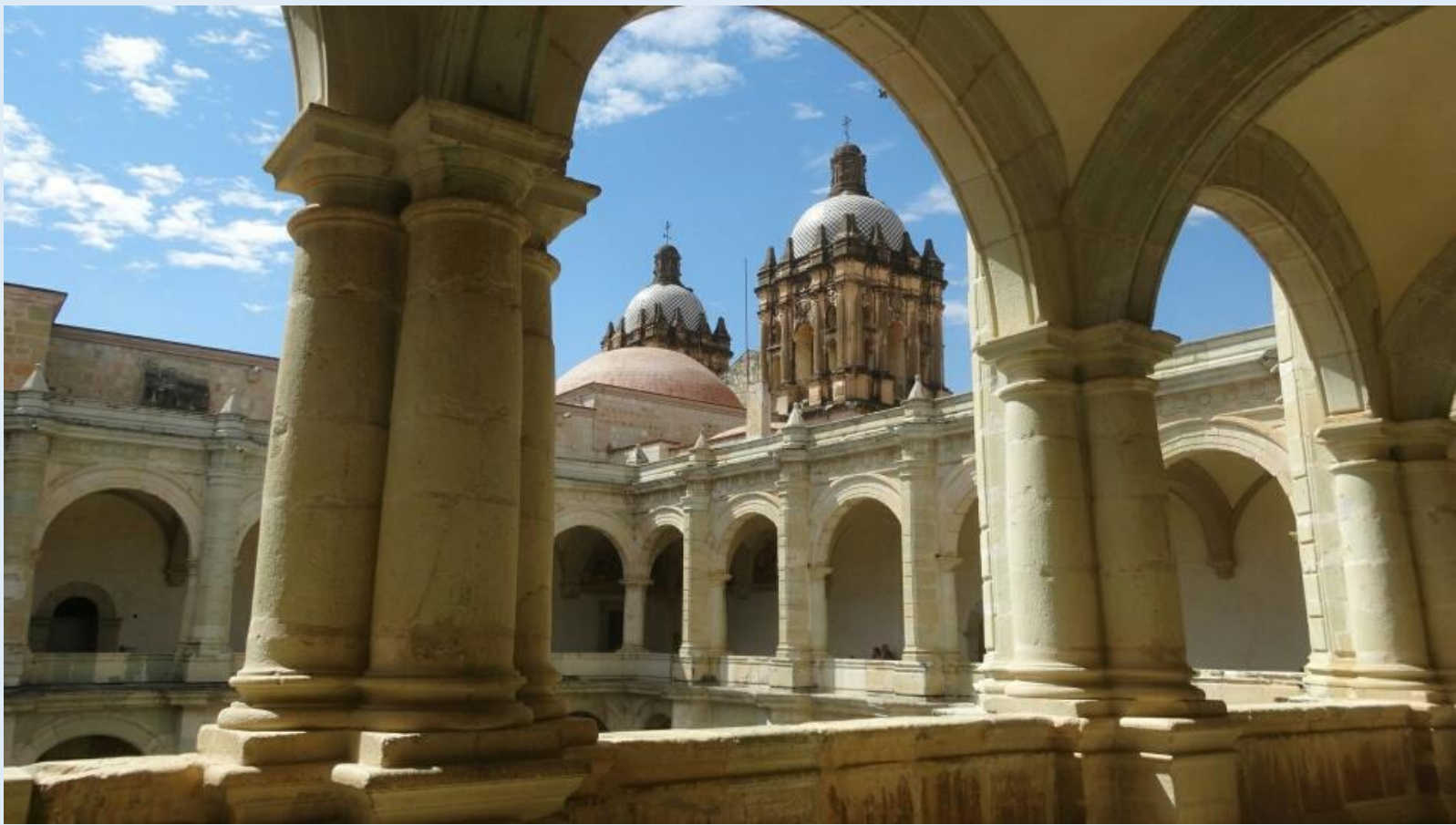
Museo de las Culturas de Oaxaca