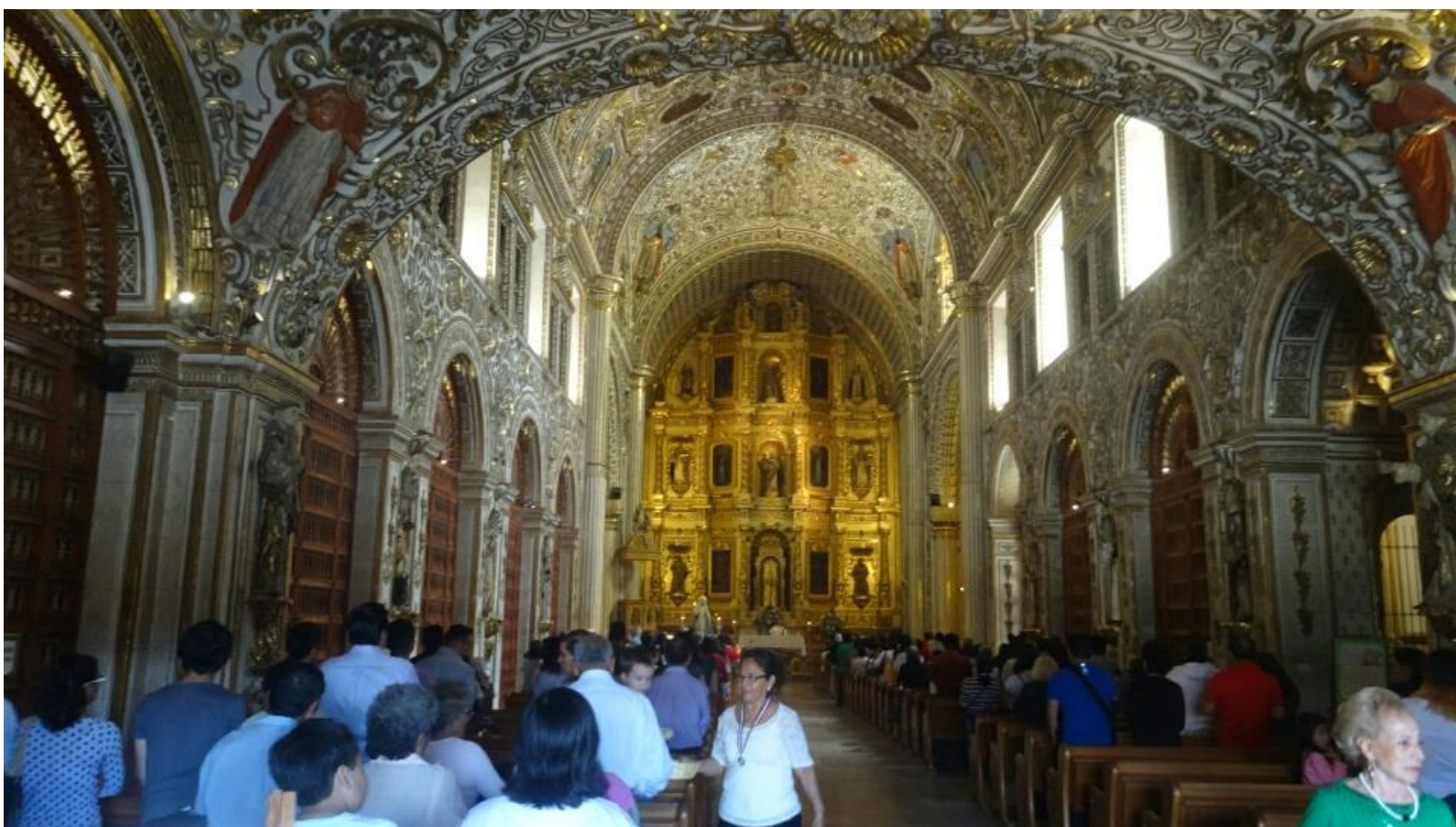
Templo de Santo Domingo