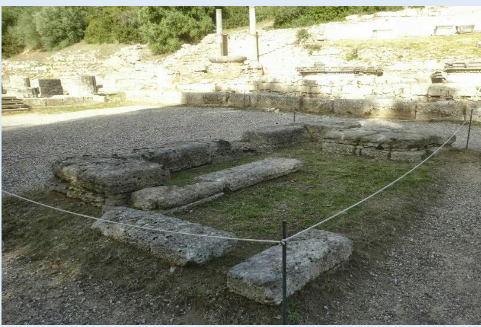
Site of the Olympic Torch Lighting