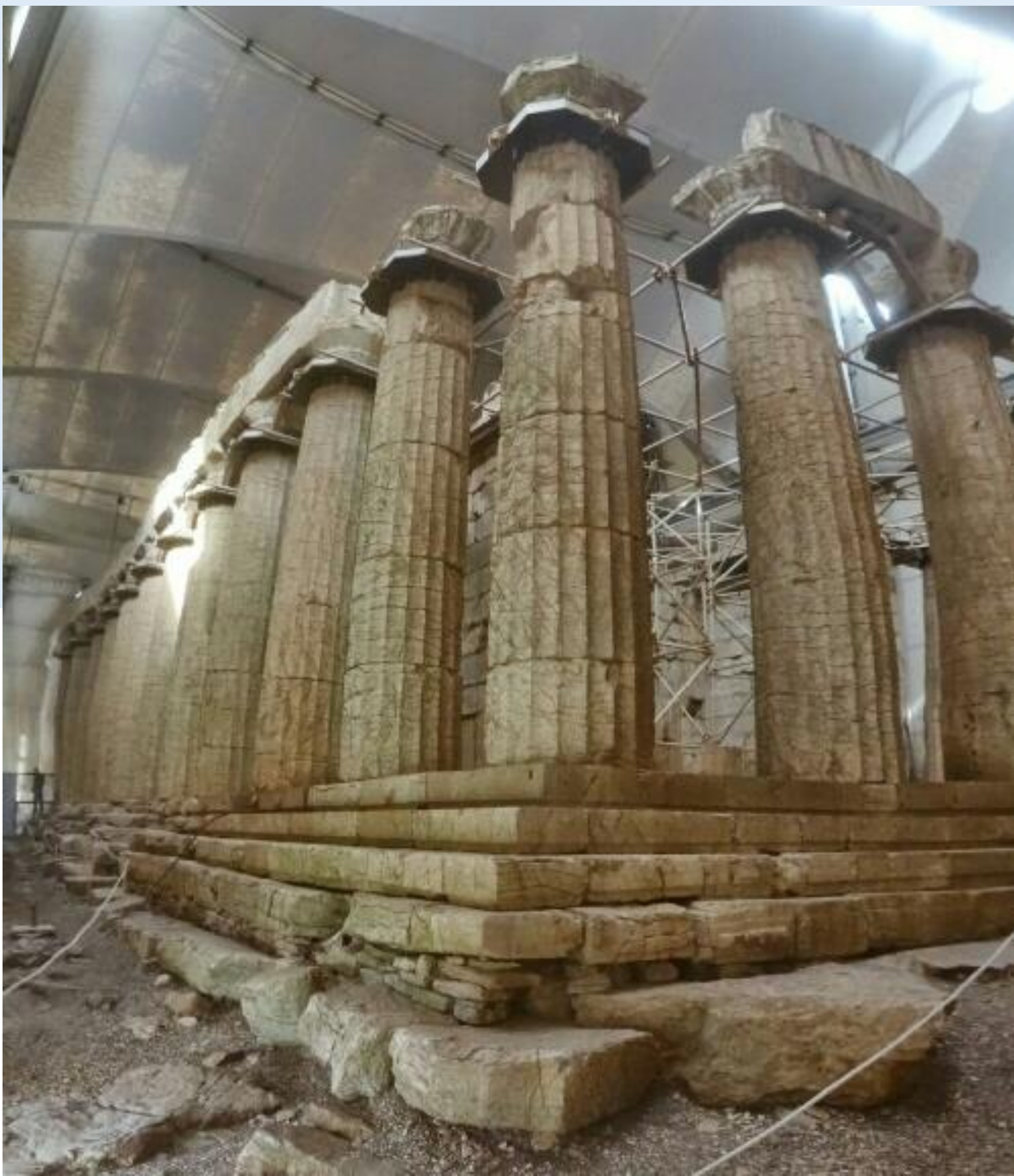
Temple of Apollo Epicurius at Bassae