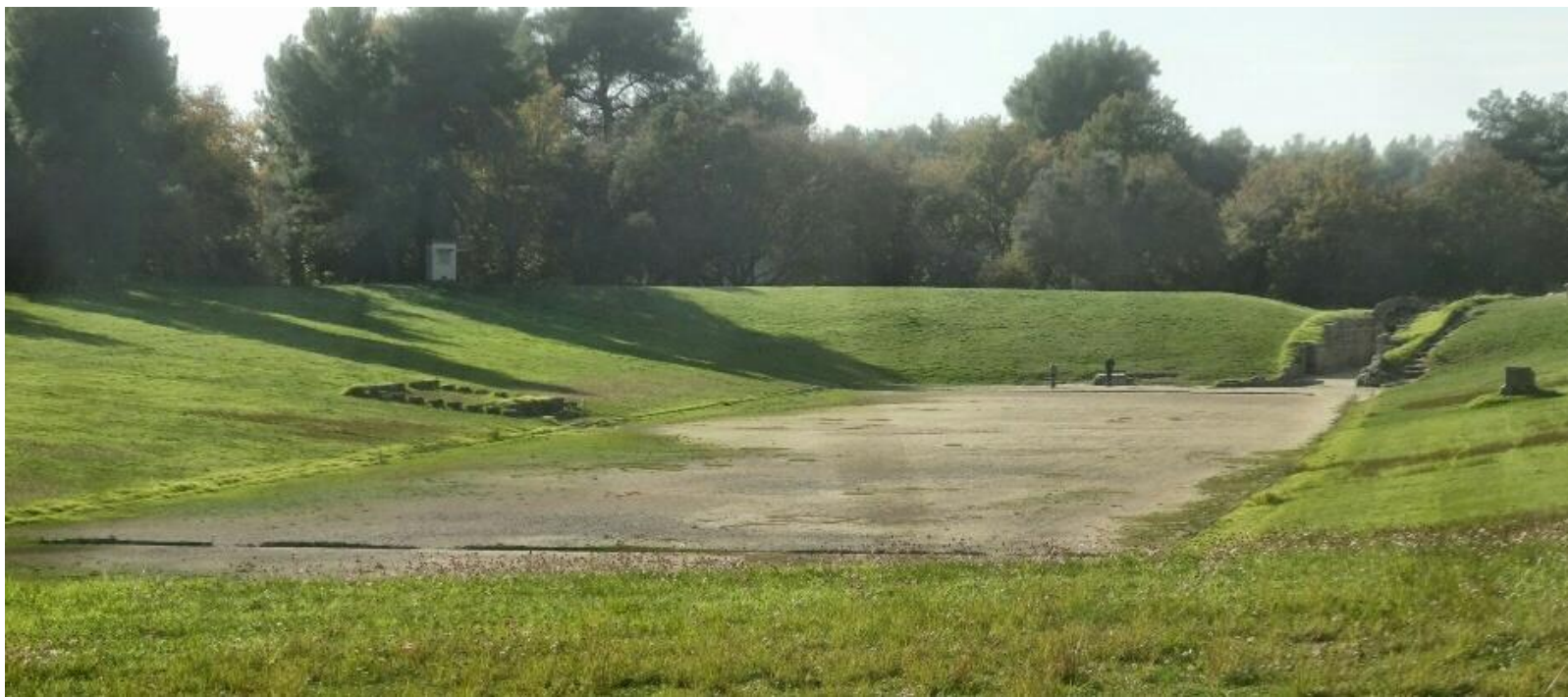
The First Olympic Stadium