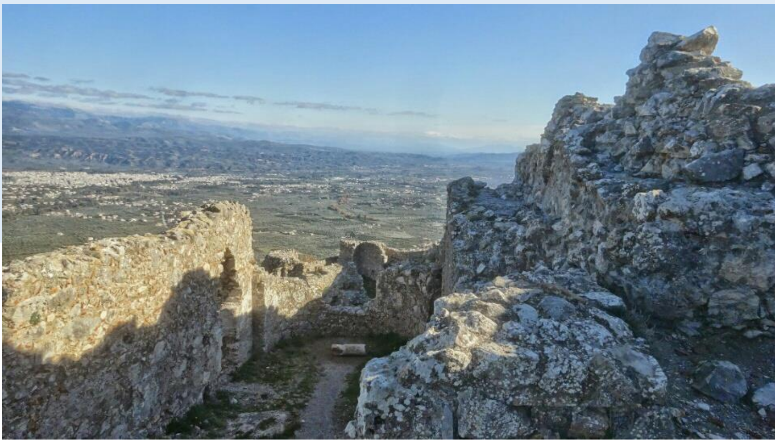
Sparta from Mystras Citadel