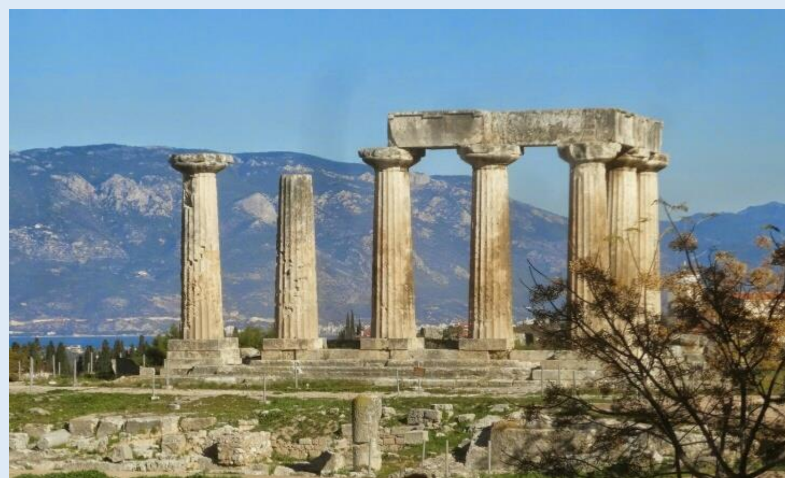
Temple of Poseidon at Cape Sounio