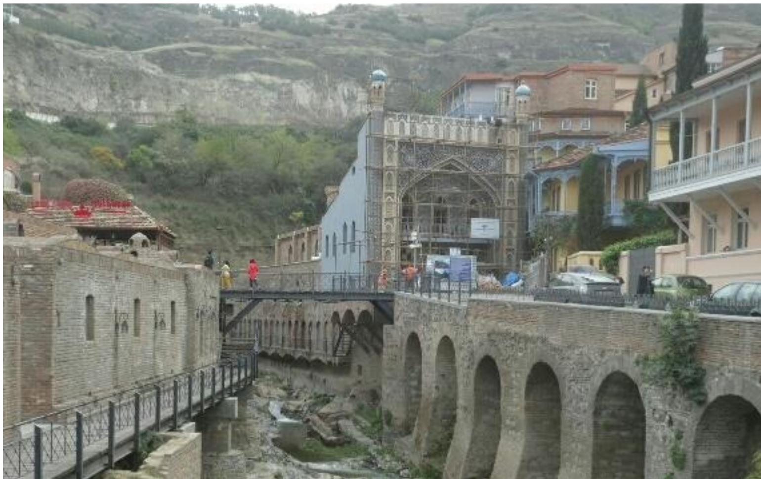
Sulfur Baths & the River