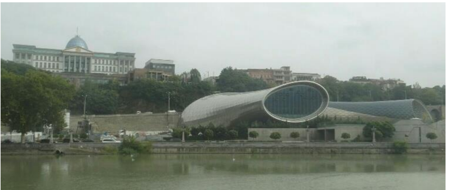
Rhike Park & The Presidential Palace