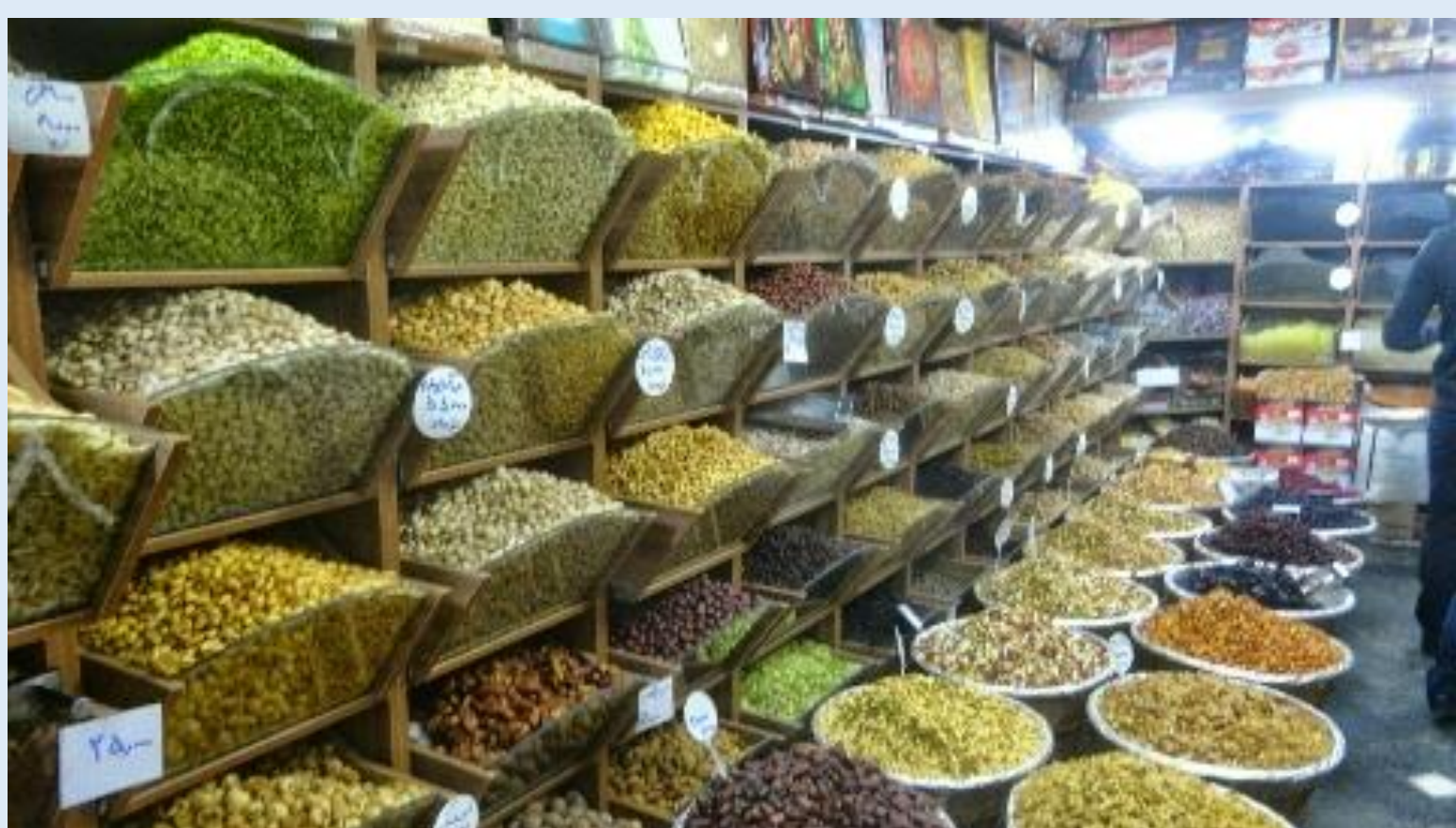
Grand Bazar Shop