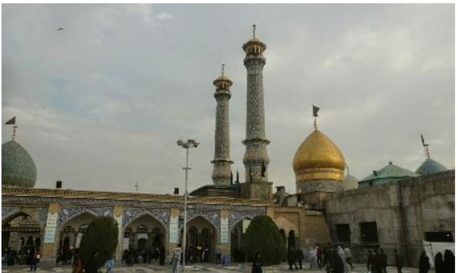
Shah Abdol Azim Shrine