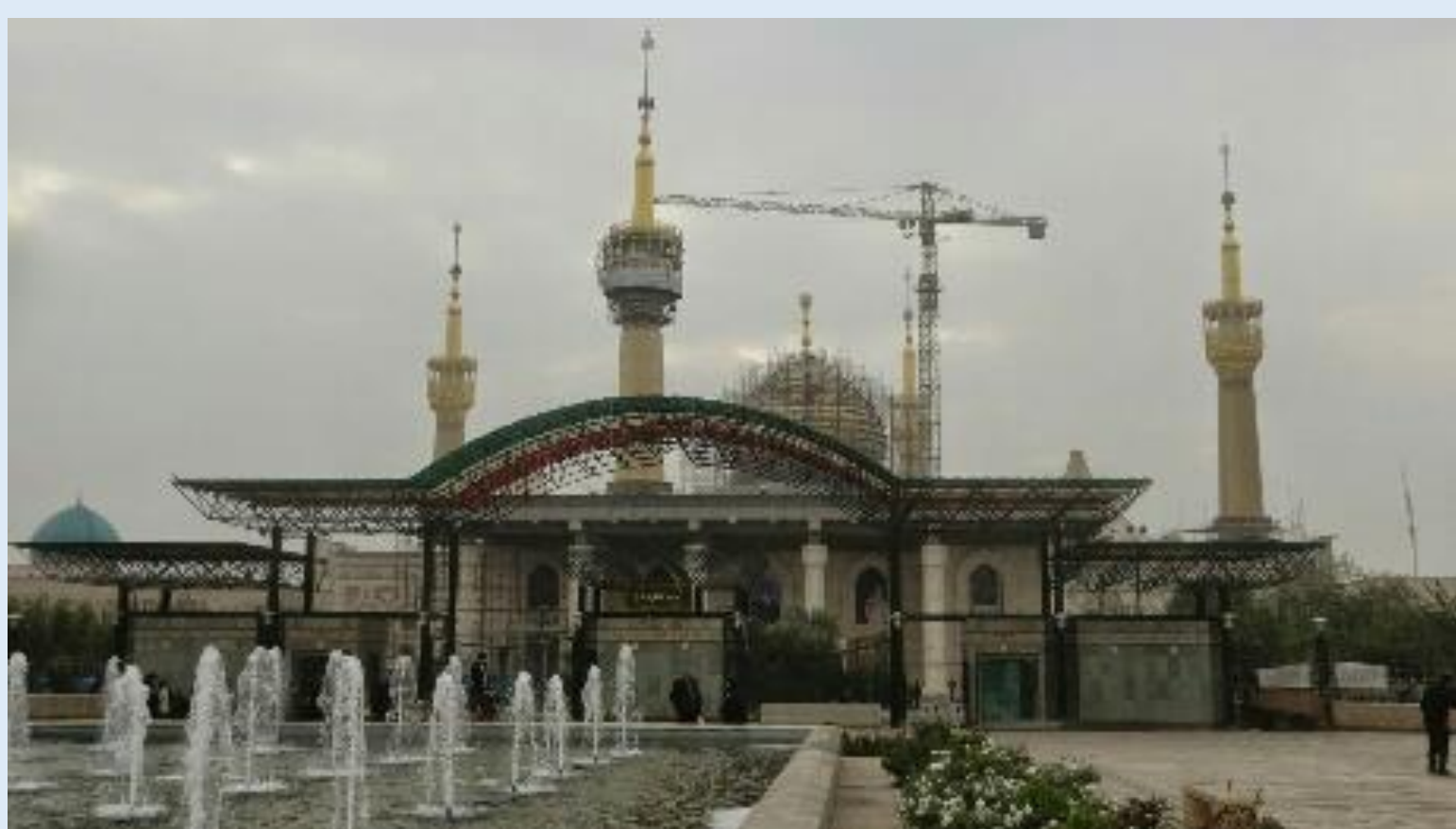
Ayatollah Khomeini Mausoleum