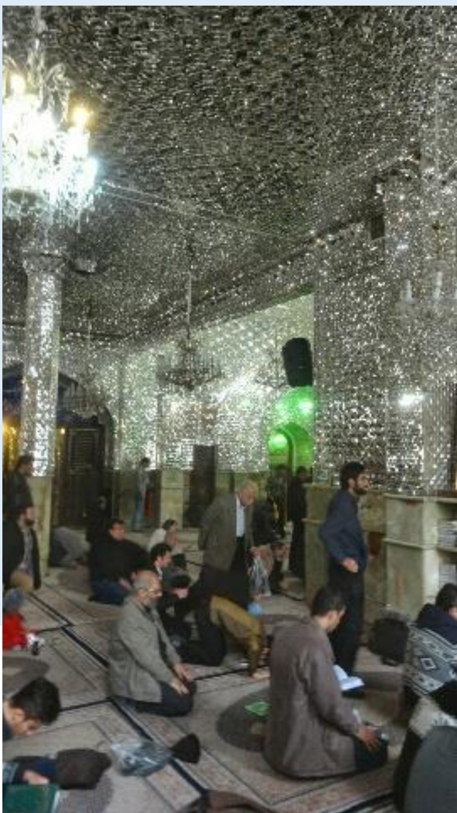
Shah Abdol Azim Shrine