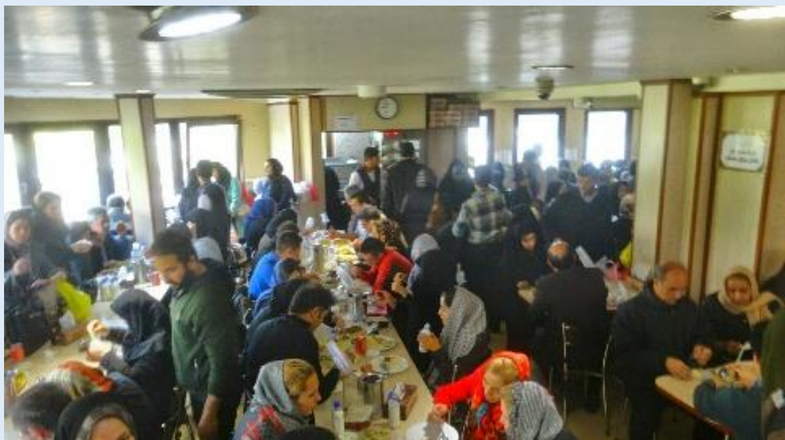
Lunch at the Grand Bazar