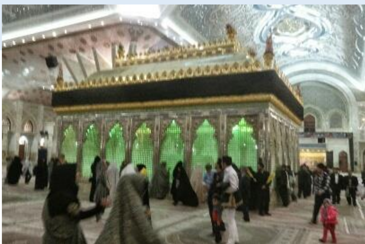
Ayatollah Khomeini Tomb