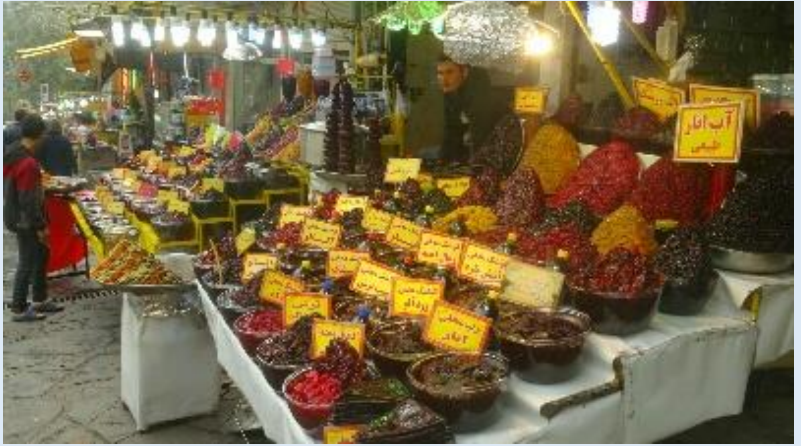
Darband Snack Shop