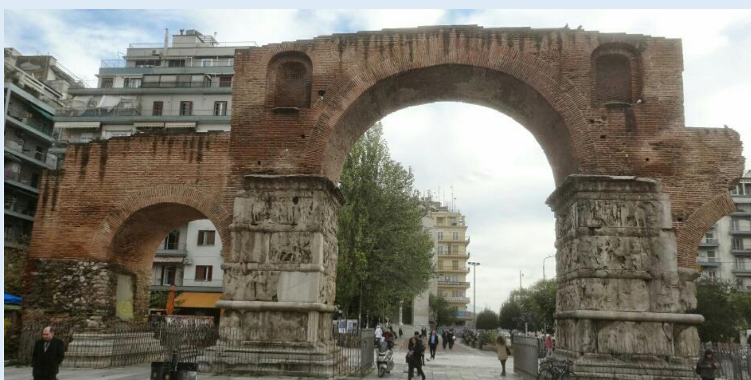
Arch of Triumph