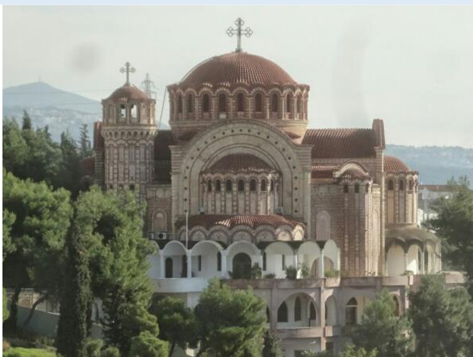
Church of St Paul