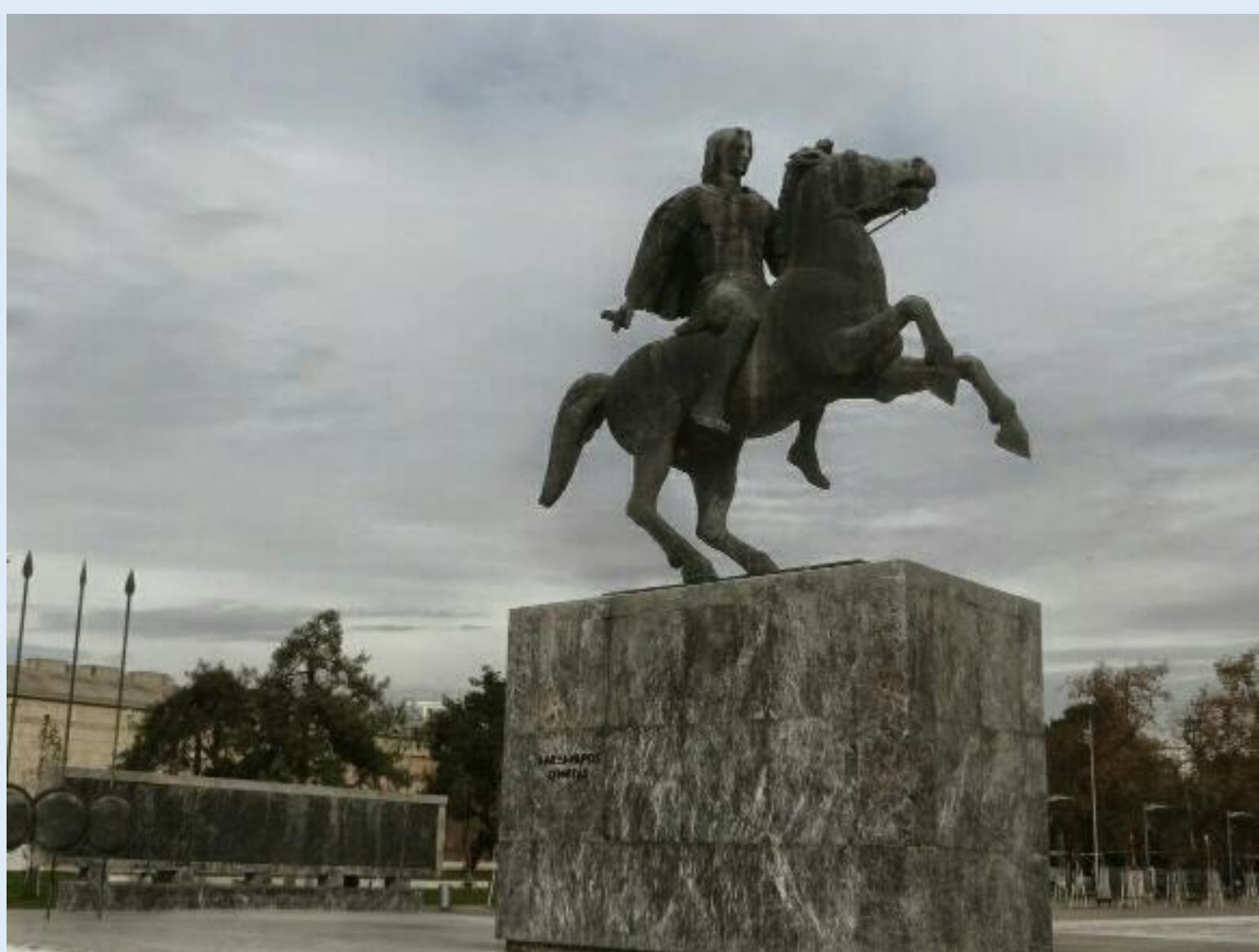
Alexander the Great