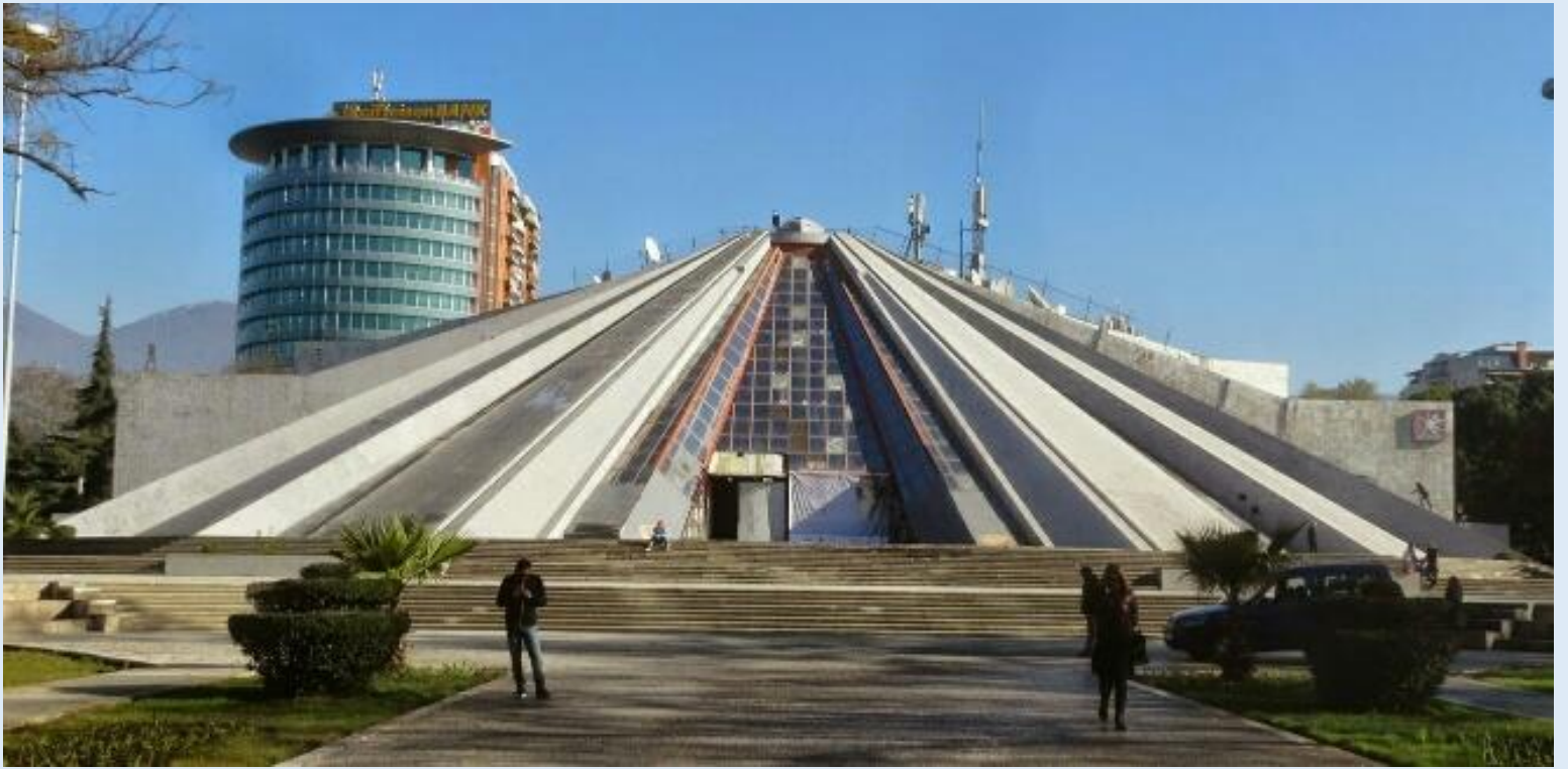
Tirana e Re Piramida