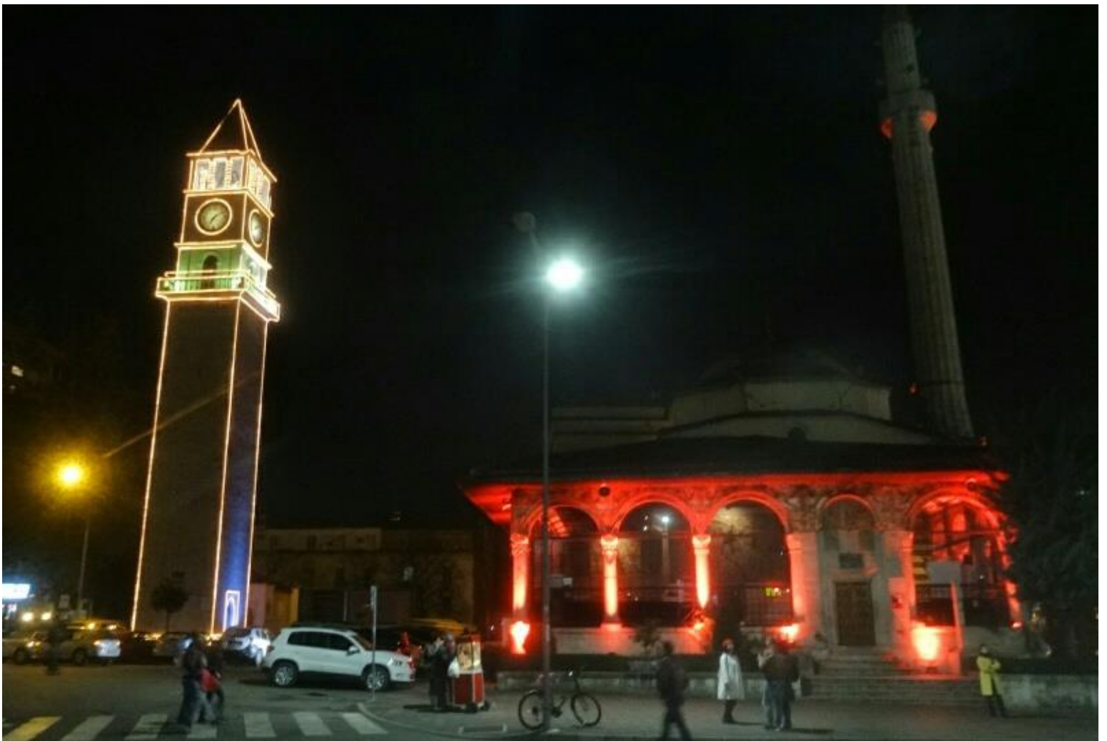
Et'hem Bej Mosque and Clock Tower