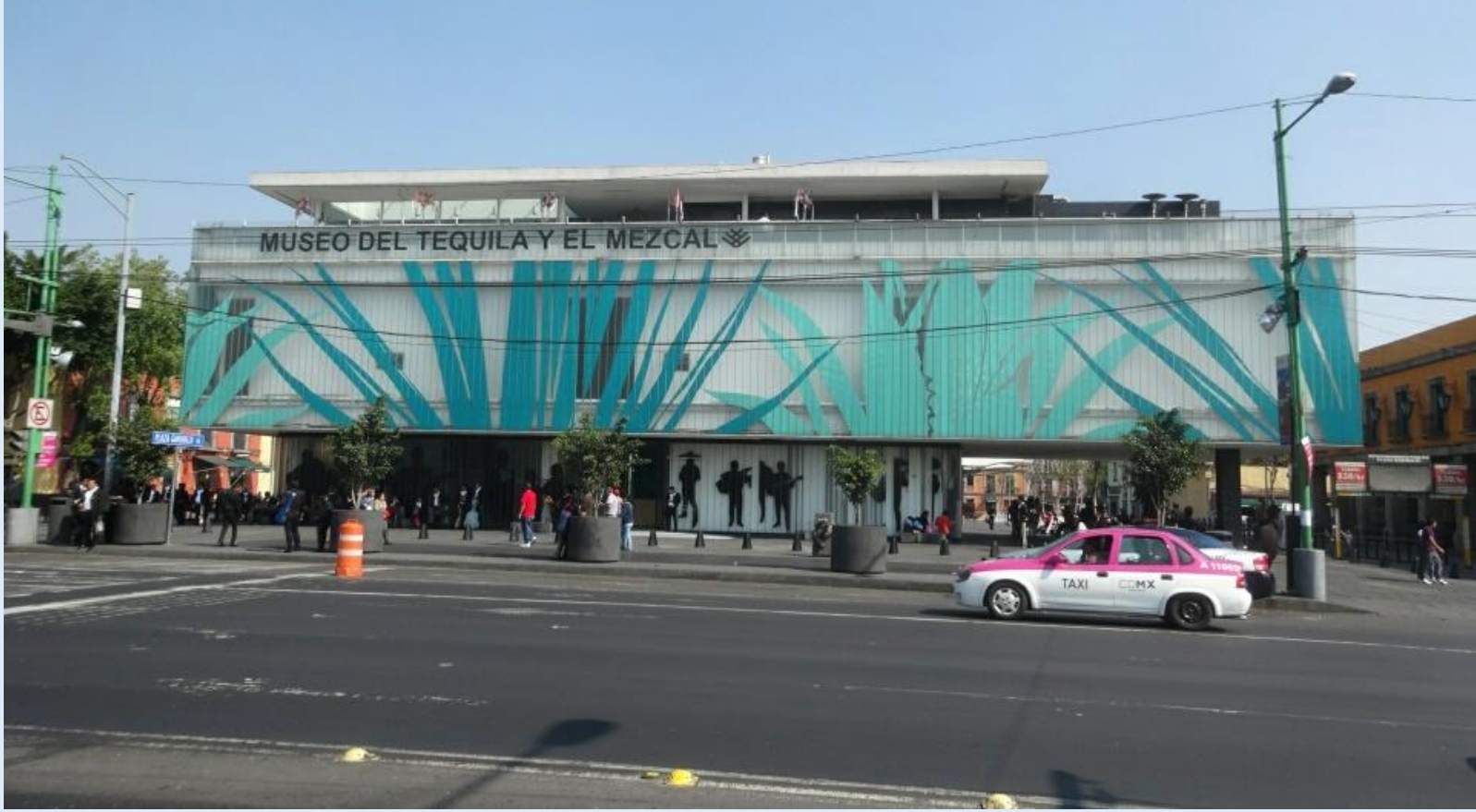
Museo del Tequila el Mezcal