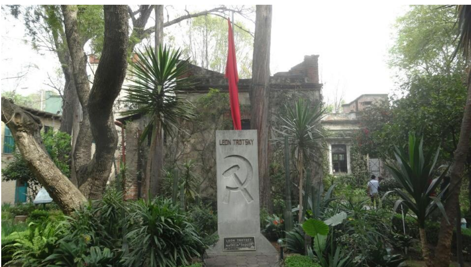
Leon Trotsky's Grave