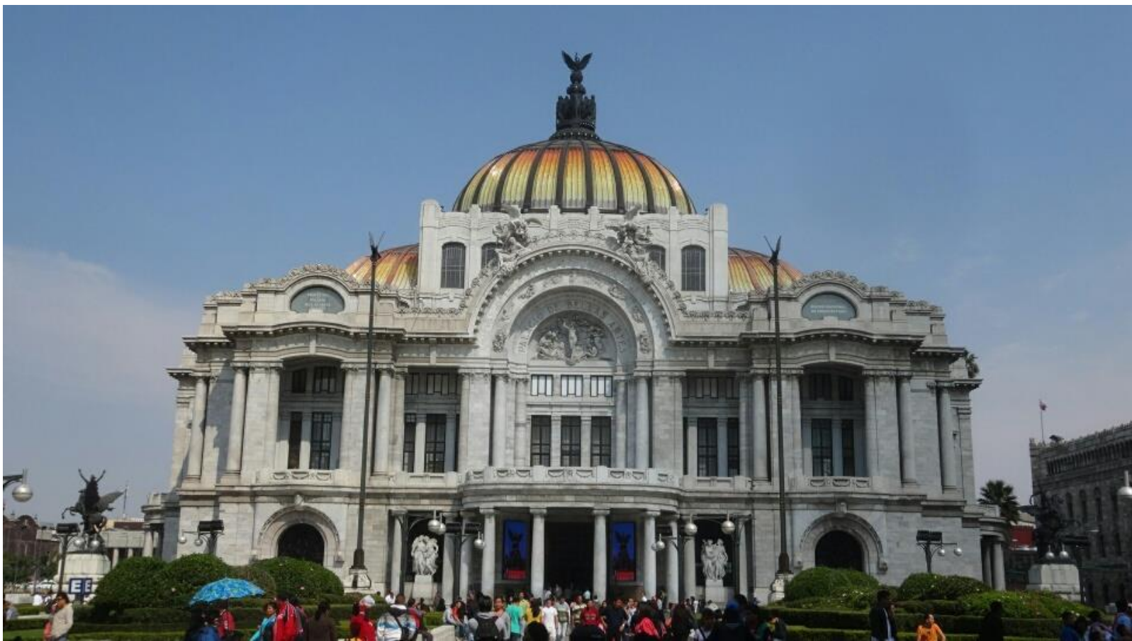
Palacio de Bellas Artes