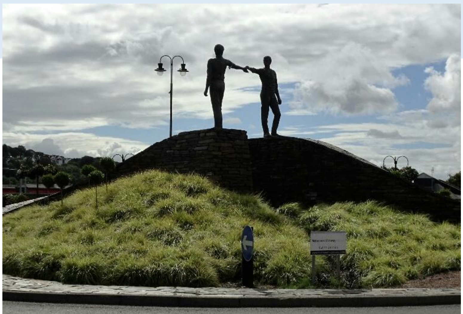
Hands Across The Divide