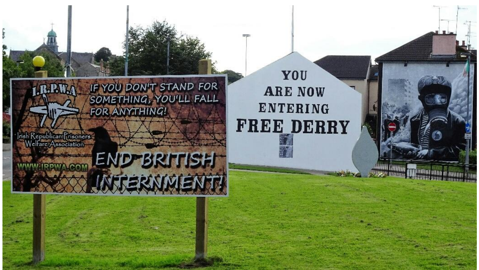
Free Derry Corner