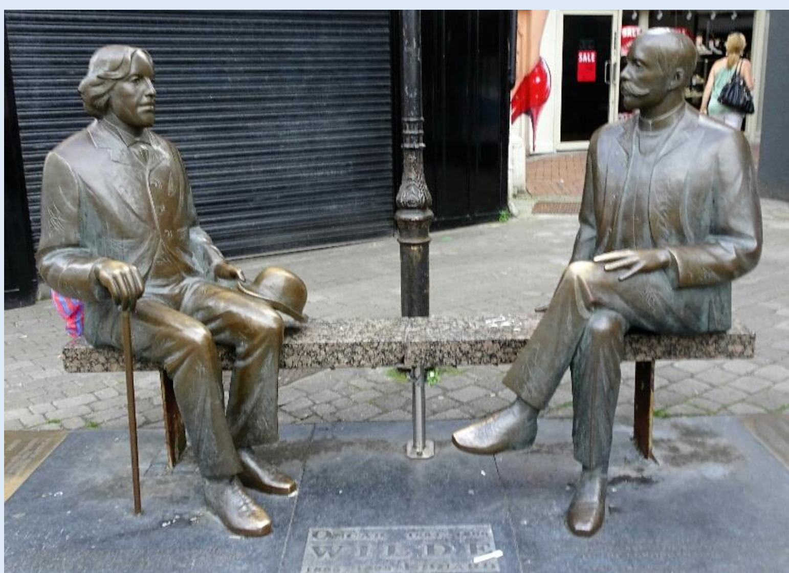
Galway Oscar Wilde & Eduard Vilde