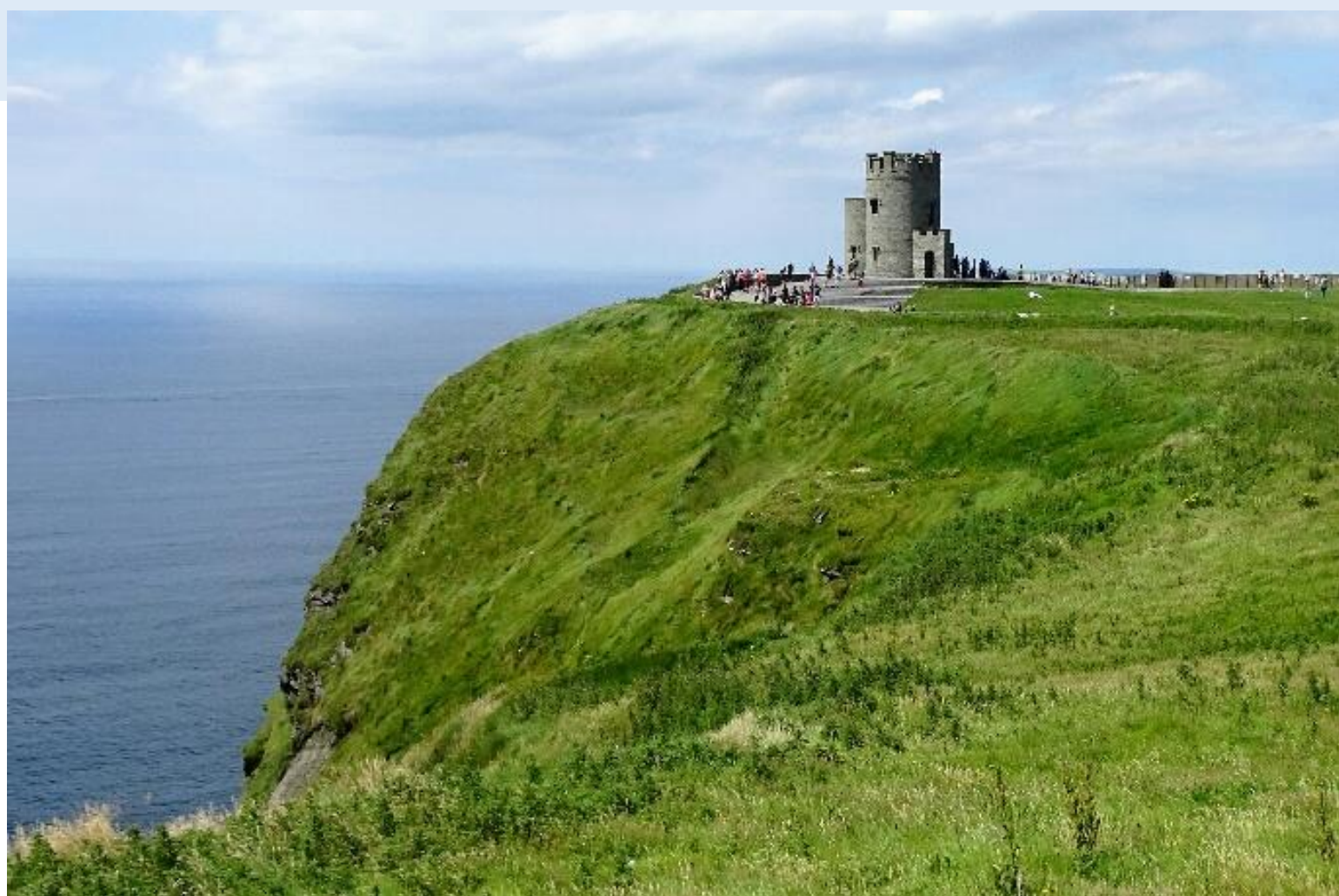
Cliffs of Moher