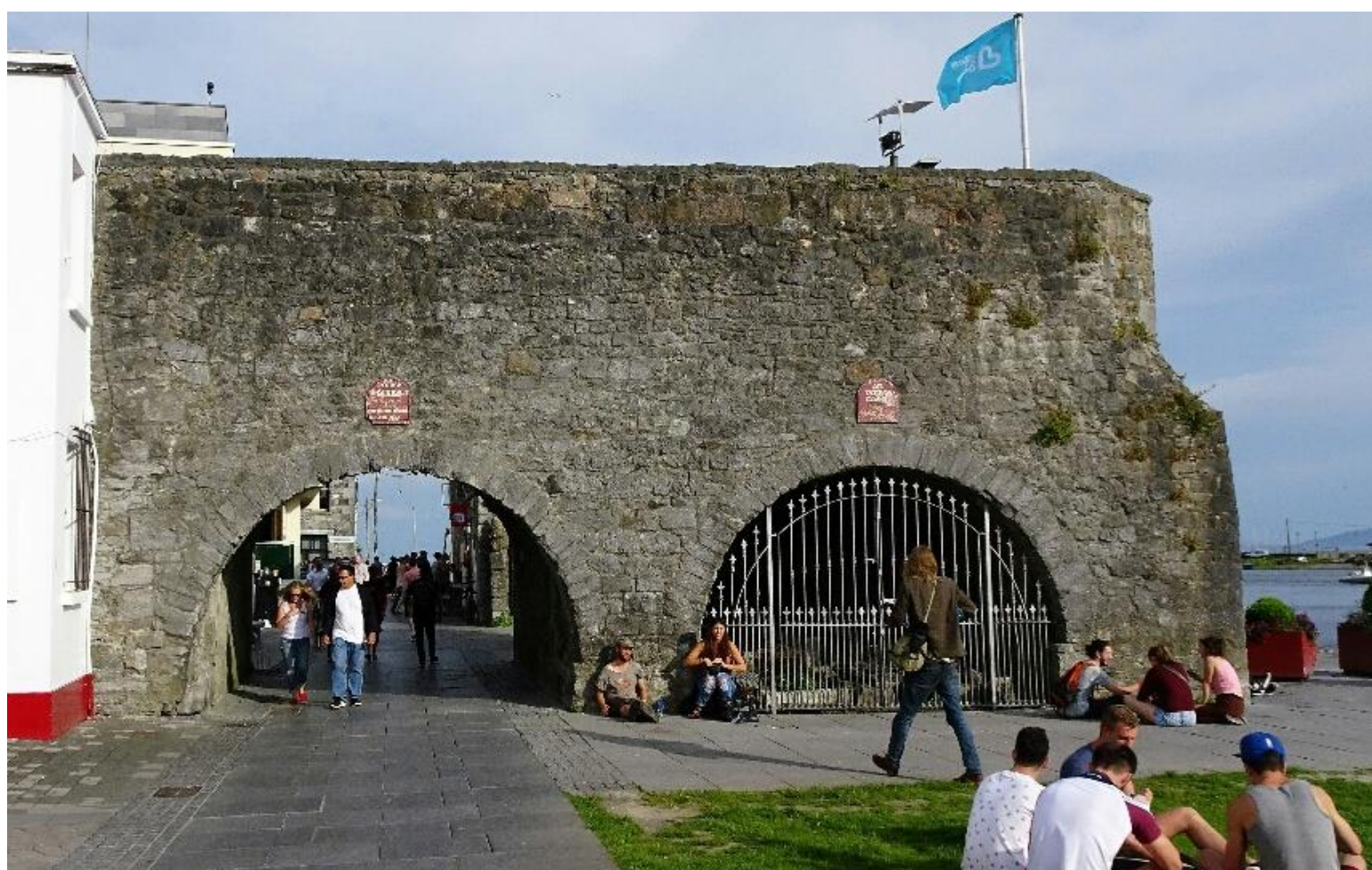
Galway Spanish Arch