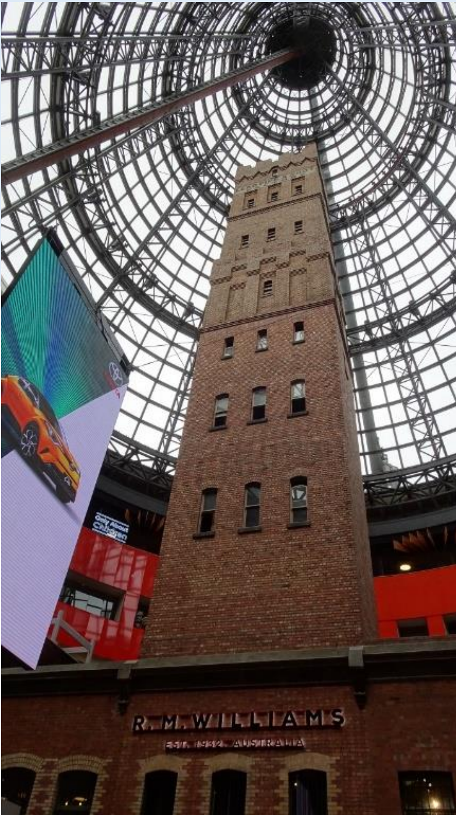
Coops Shot Tower