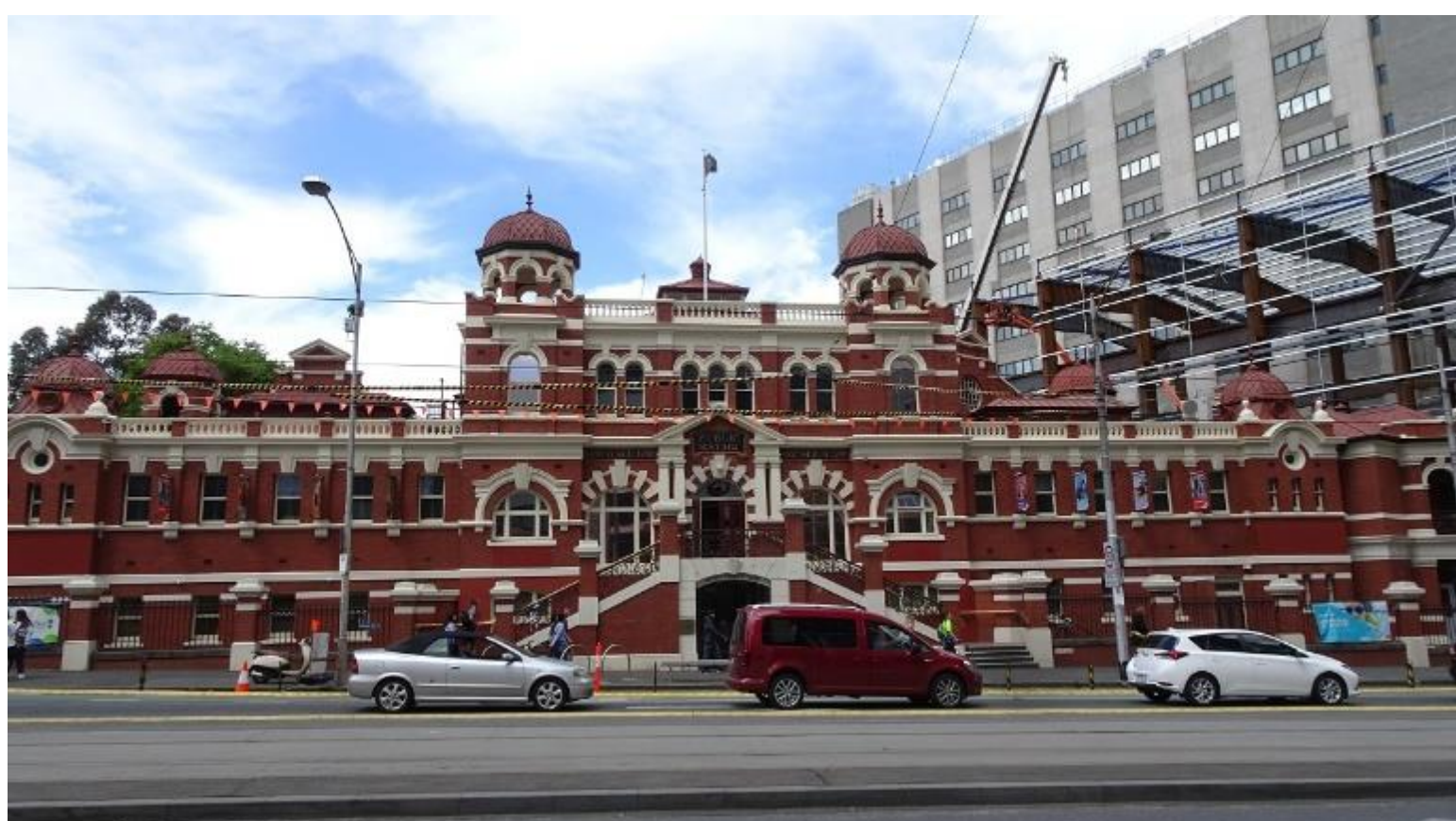
Old Bath House