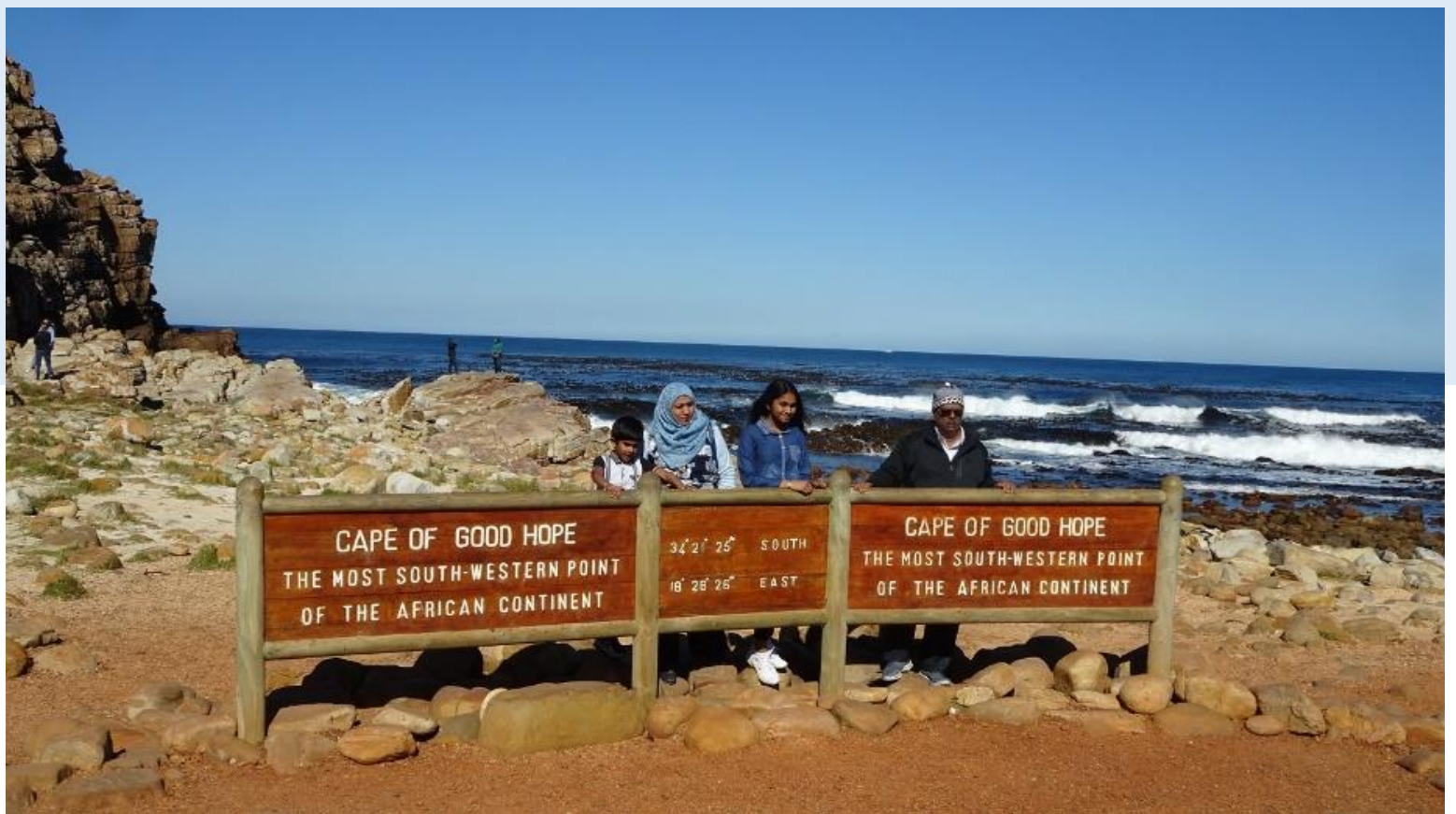
Cape of Good Hope