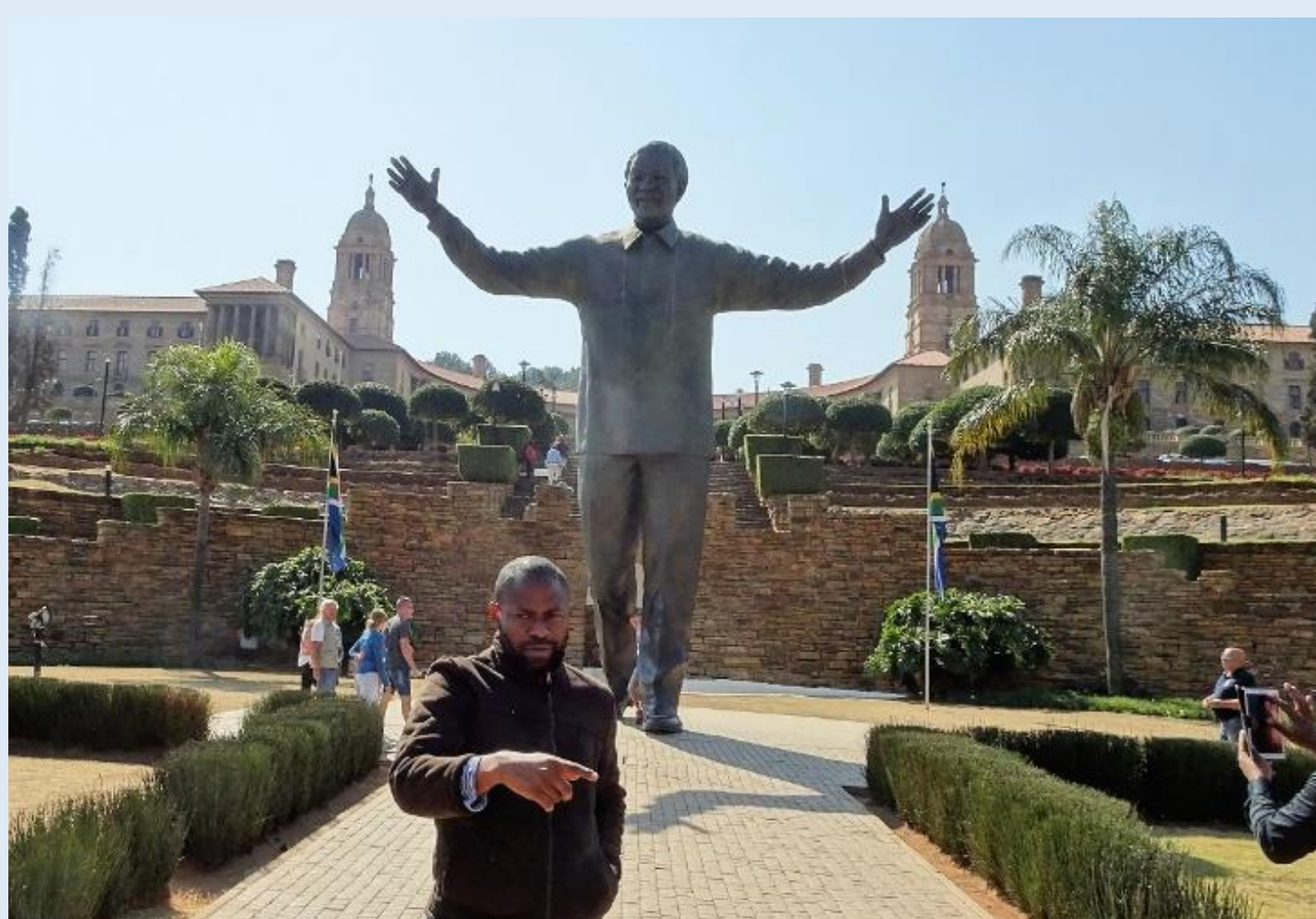
Pretoria Nelson Mandela Statue