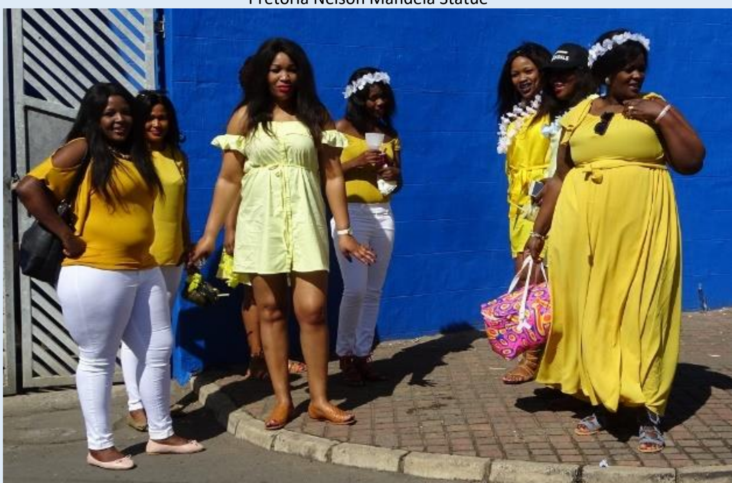
Durban Wilson's Wharf