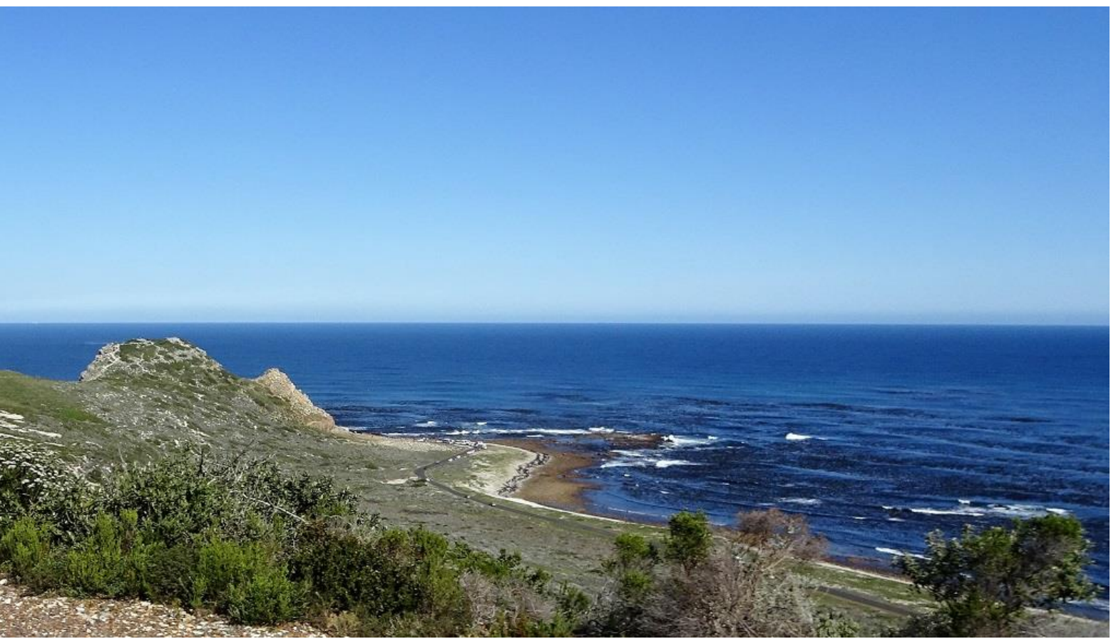
Cape of Good Hope