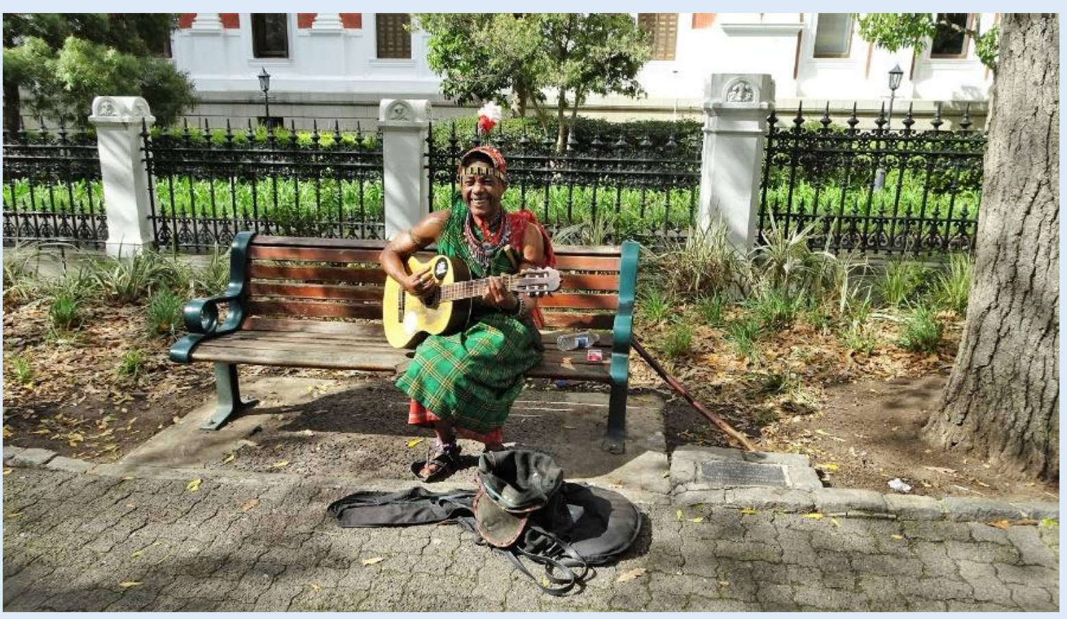
Cape Town Busker