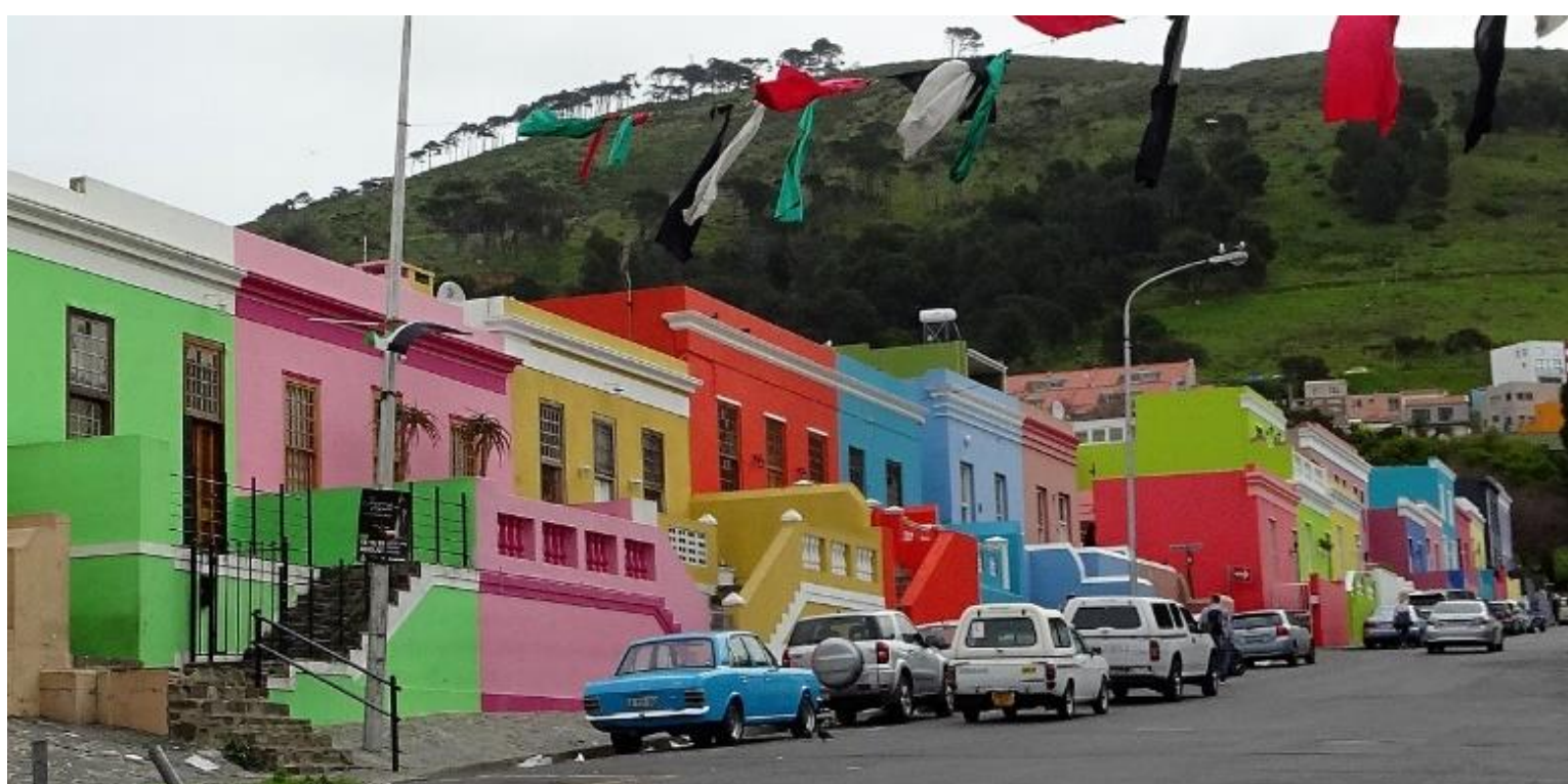
Cape Town Bo-Kaap