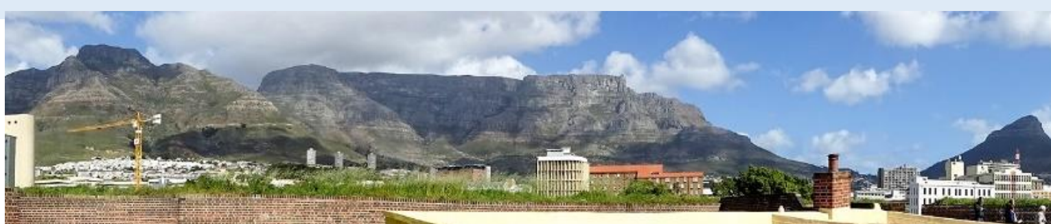
Cape Town Table Mountain