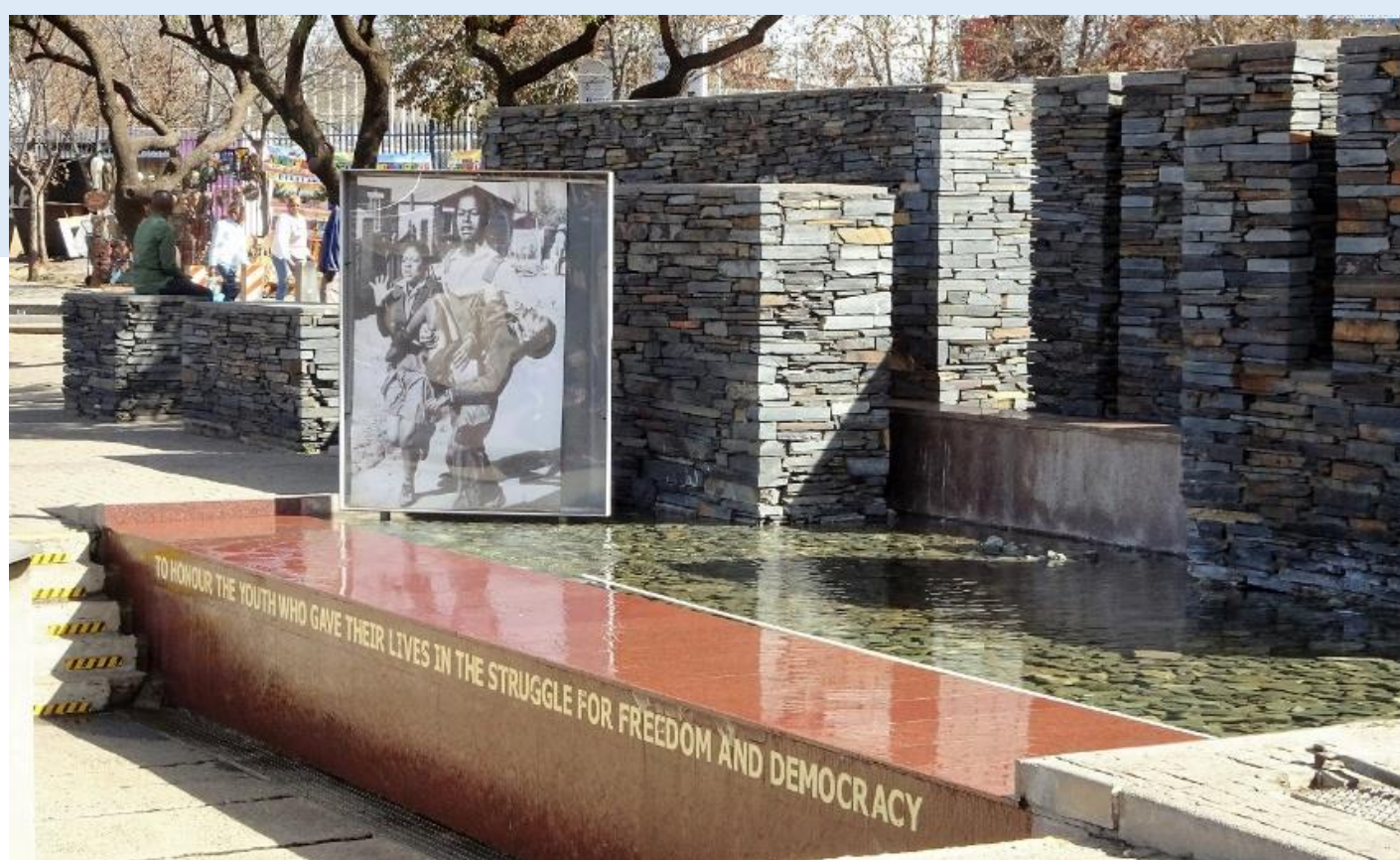
Soweto Hector Pieterse Memorial