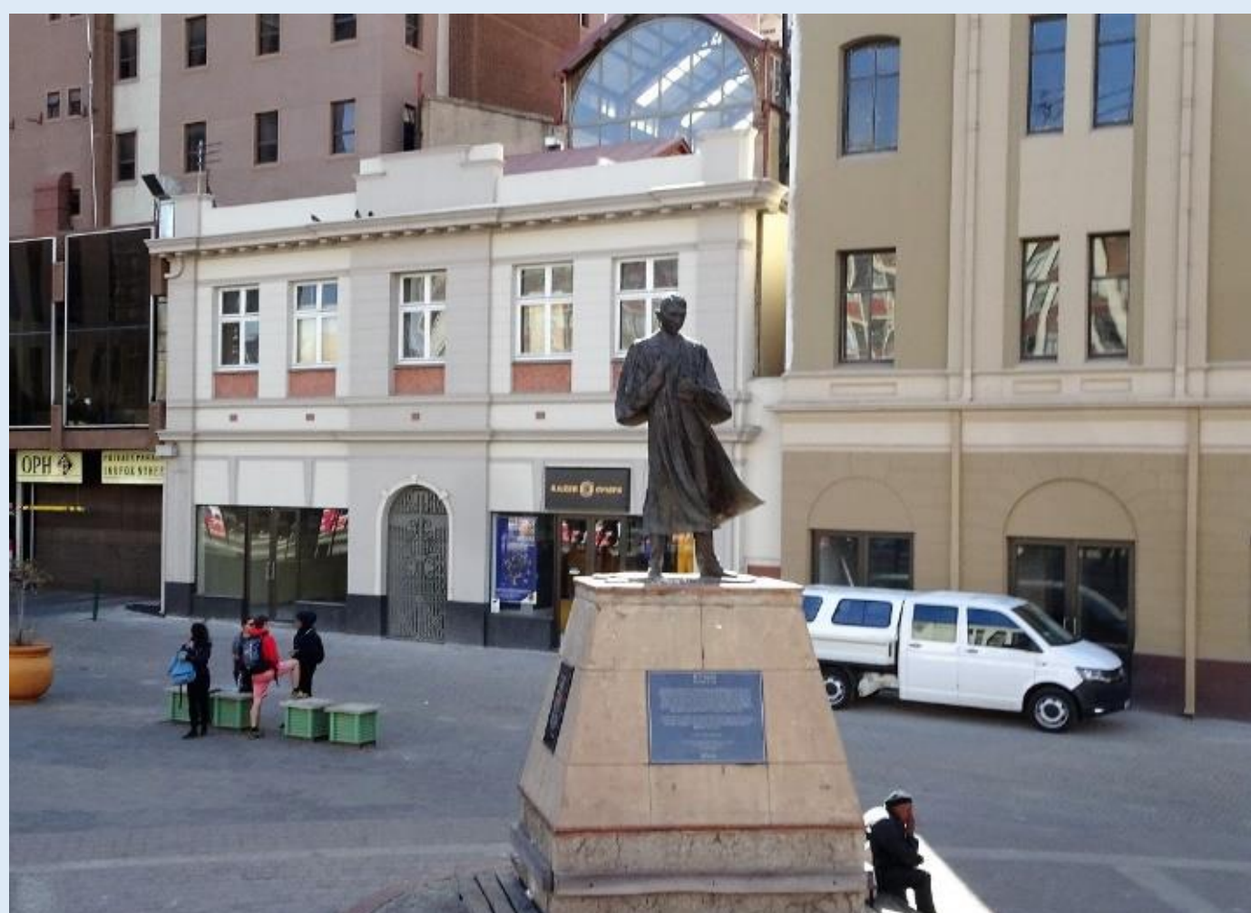
Johannesburg Gandhi Square